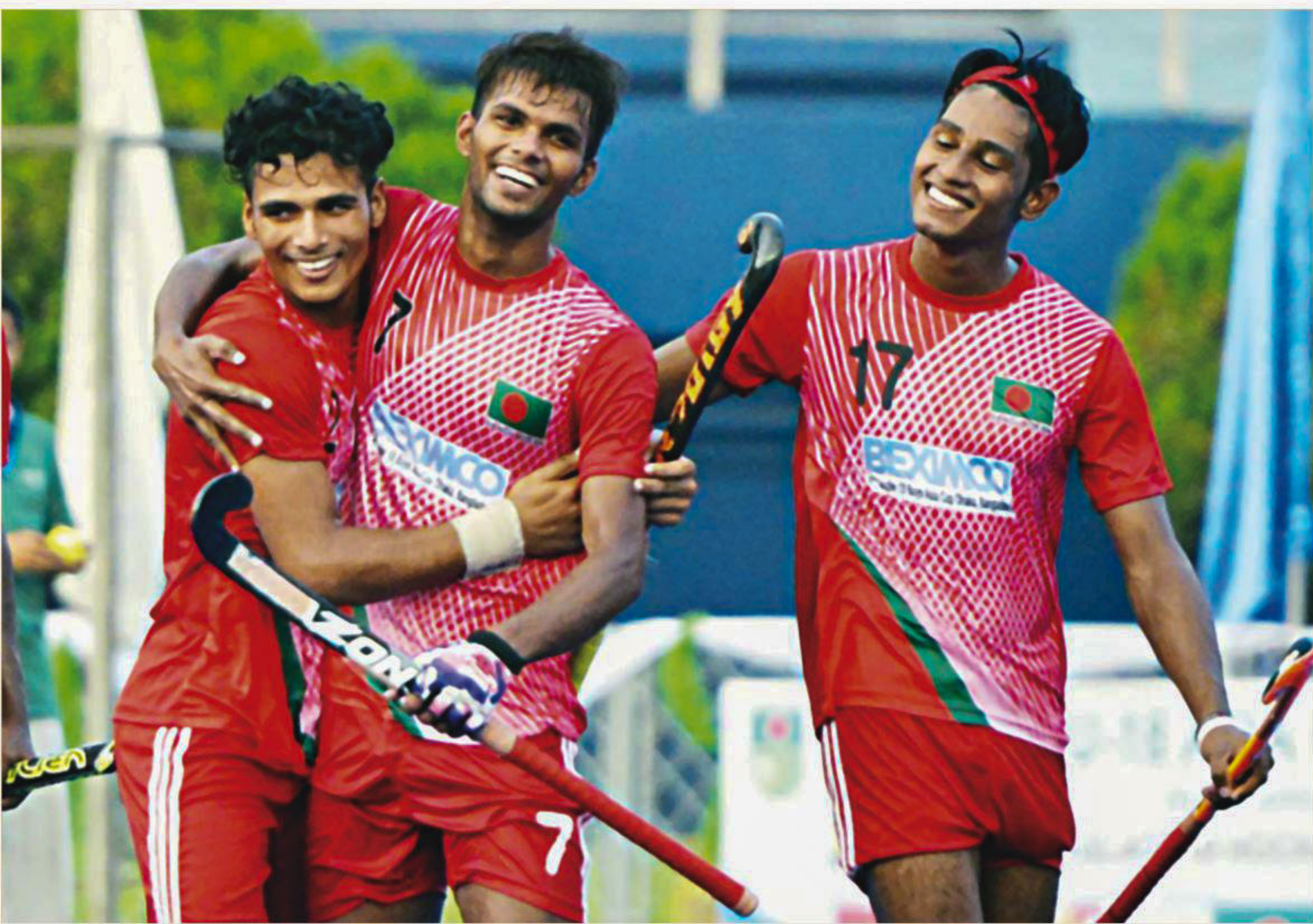
Bangladesh players celebrate one of the ten goals against Oman during their U-18 Asia Cup fixture at the Maulana Bhasani Hockey Stadium yesterday.