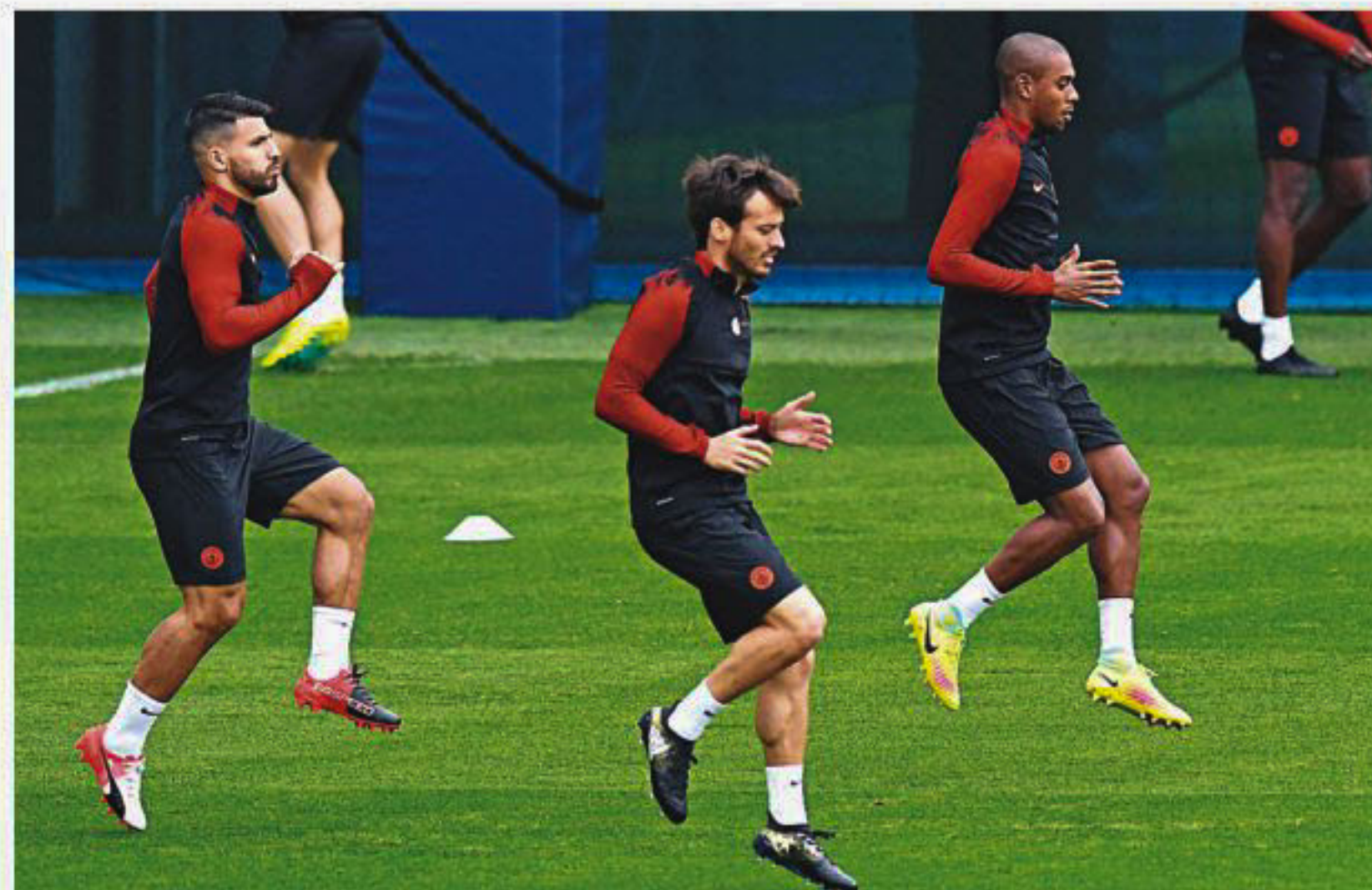
Manchester City stars Sergio Aguero (L), David Silva and Fernandinho (R) take part in a training session at the club's Football Academy Campus yesterday ahead of their Champions League match against Celtic.

After Guardiola failed to steer Bayern to the Champions League final,