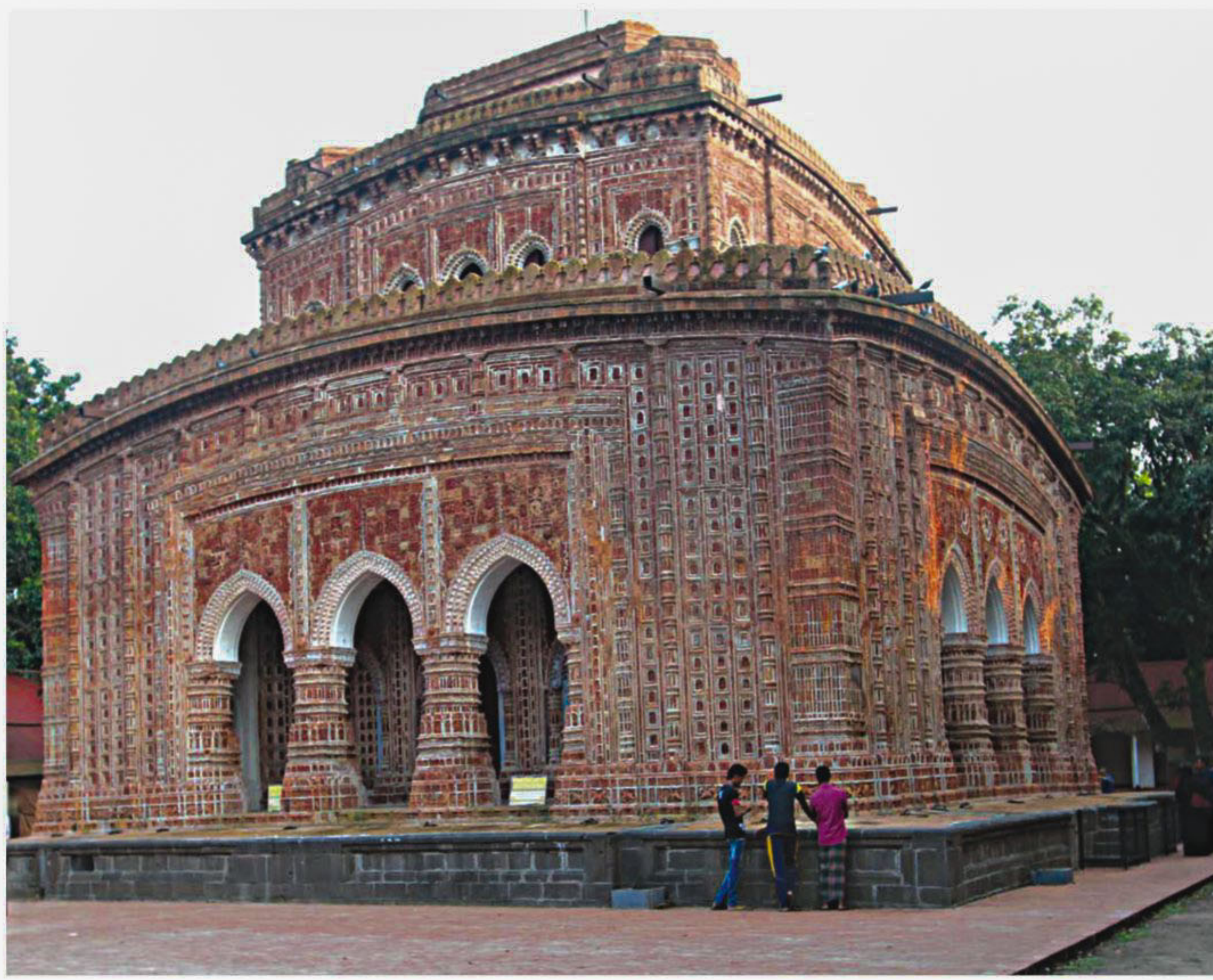
The stunning Kantaji temple in Dinajpur after renovation. Restored terracotta carvings on top right, and worn-out terracotta works, middle and bottom, before the restoration and site development began in August last year.