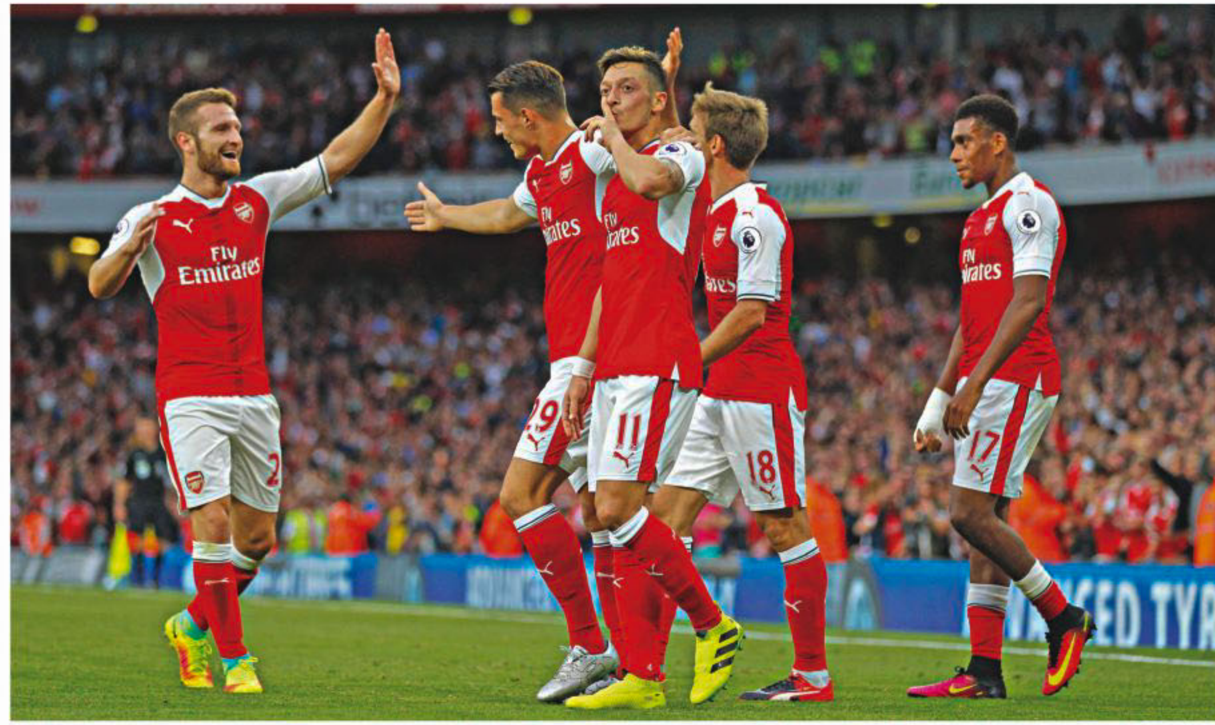
Arsenal midfielder Mesut Ozil (C) celebrates scoring the third goal with teammates during their Premier League encounter at the Emirates Stadium yesterday.

Arsenal 3 (Sanchez 11, Walcott 14, Ozil 40) Chelsea 0 Bournemouth 1 (Stanislas 23) Everton 0 Liverpool 5 (Lallana 17, Milner 30-pen, 71-pen, Mane 36, Coutinho 52) Hull 1 (Meyler 51) Manchester United 4 (Smalling 22, Mata 37, Rashford 40, Pogba 42) Leicester 1 (Gray 59) Middlesbrough 1 (Gibson 65) Tottenham 2 (Son 7, 23) Stoke 1 (Allen 73) West Brom 1 (Rondon 90+1) Sunderland 2 (Defoe 39, 60) Crystal Palace 3 (Ledley 61, McArthur 76, Benteke 90+4) Swansea 1 (Llorente 13) Manchester City 3 (Aguero 9, 65-pen, Sterling 77)