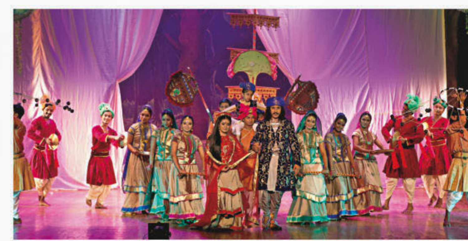
Prema and Kakon shine in the lead roles (top); the costumes and lighting makes the production a bright, enjoyable one.