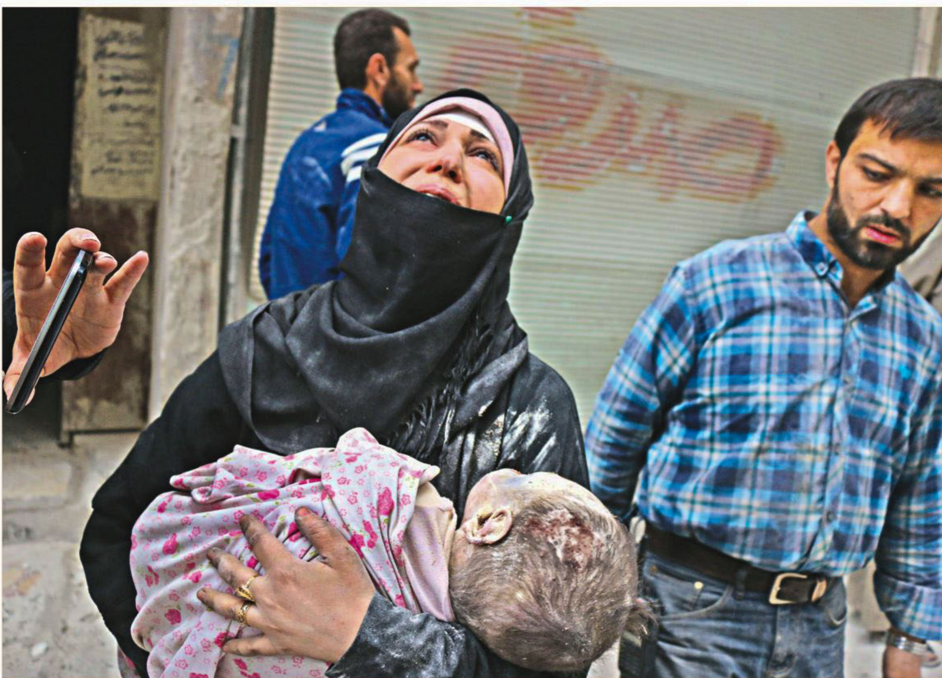
IS SHE COMPLAINING TO GOD?... A Syrian woman looks up in grief as she carries the body of her infant after a reported airstrike on the al-Muasalat area in the northern Syrian city of Aleppo.