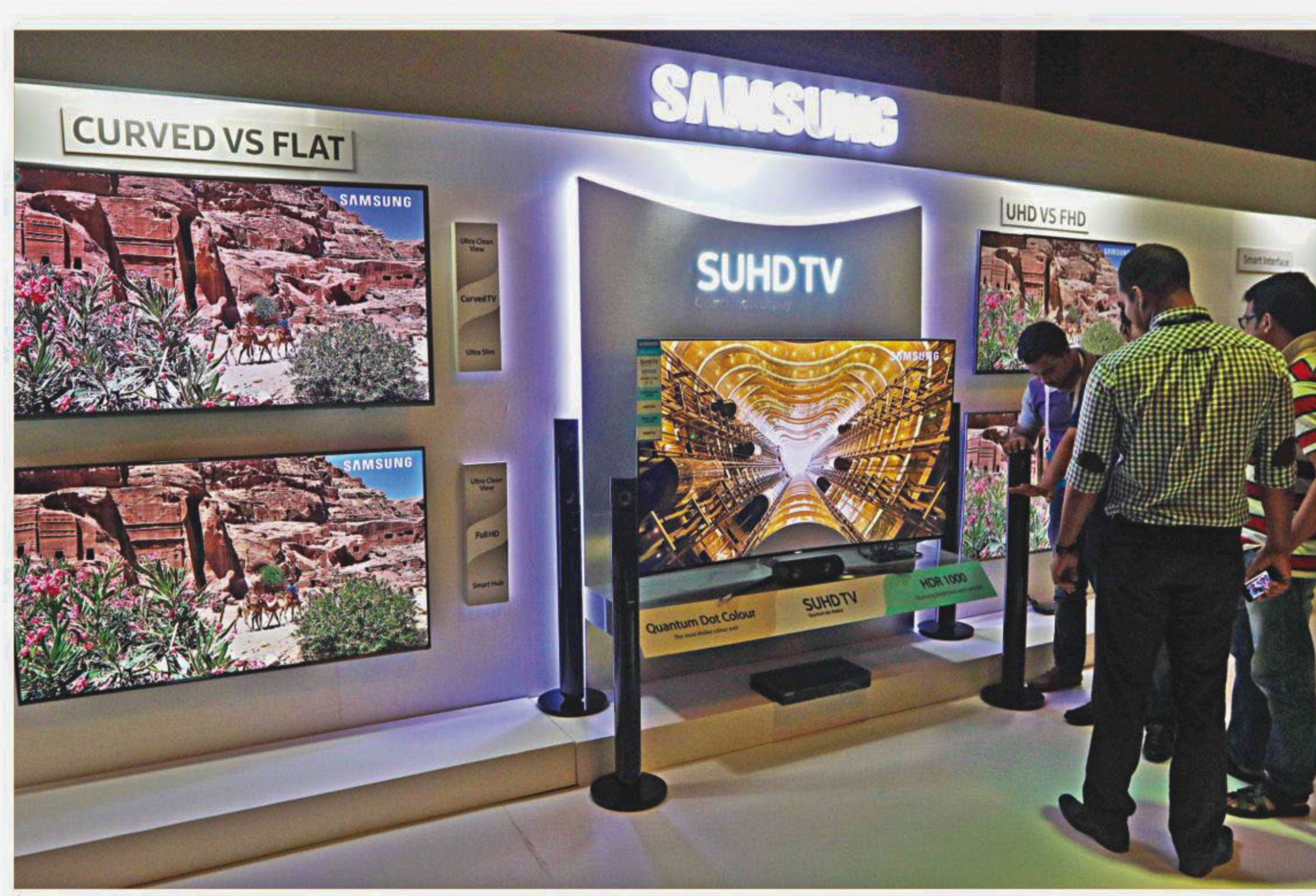
Visitors take a look at a new Samsung TV launched at an event at Radisson Hotel in Dhaka yesterday. Story on B3