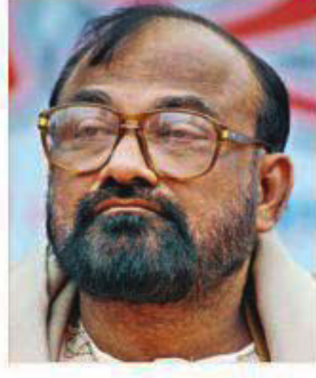
SEE PAGE 17 COL 3

The ACC investigation officer concerned on July 1, 2008, submitted a charge sheet before the court dropping names of his son and daughter.