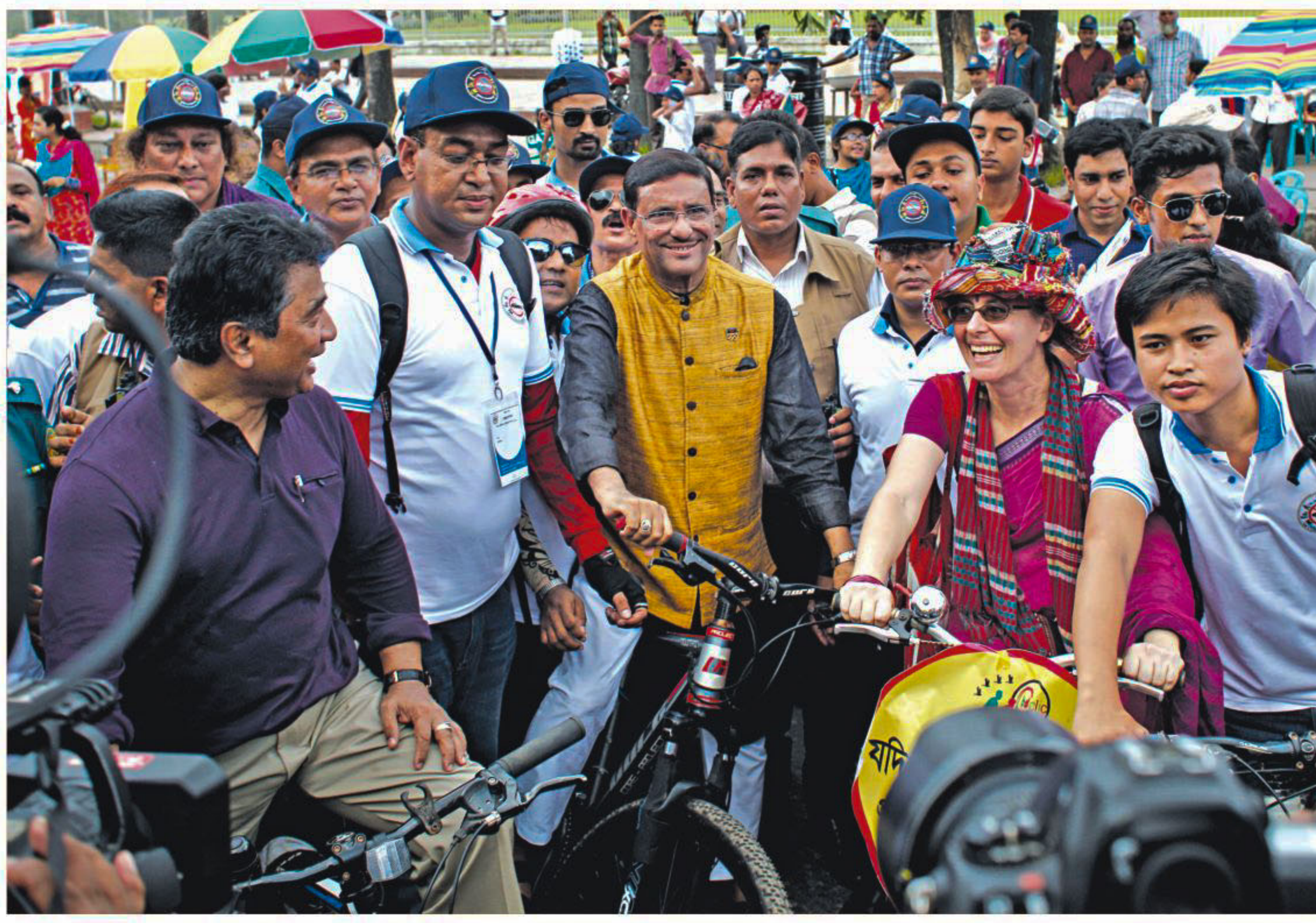
Road Transport and Bridges Minister Obaidul Quader (centre) and Dhaka North City Corporation Mayor Annisul Huq (left) on bicycles at a programme marking the World Car-free Day on Manik Mia Avenue in the capital yesterday.