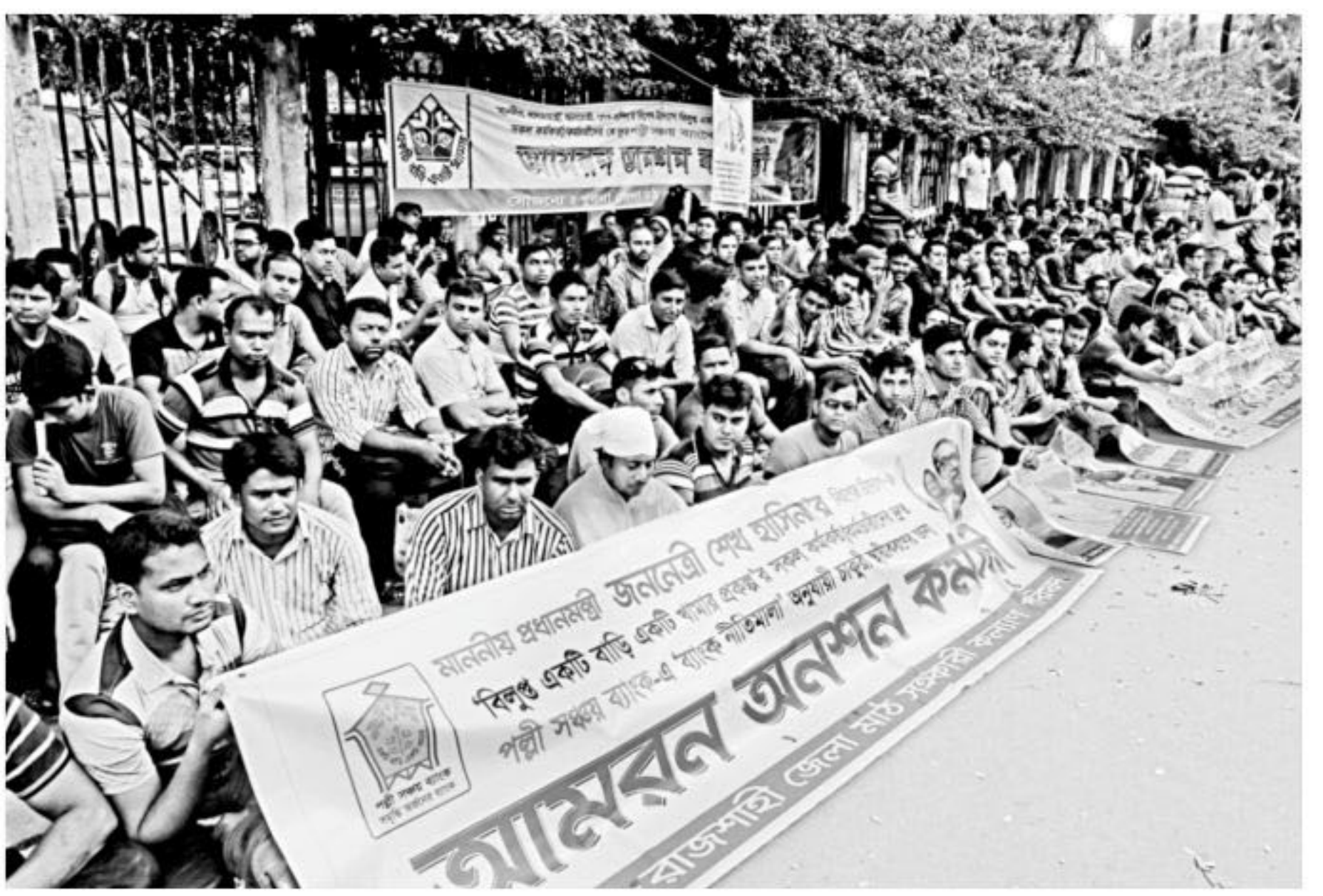
Staff of erstwhile "One home, one farm" government project from different districts at a "fast unto death" in front of the capital's Jatiya Press Club yesterday, demanding regularisation of their jobs.