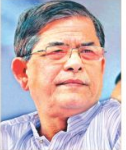
Mirza Fakhrul Islam Alamgir