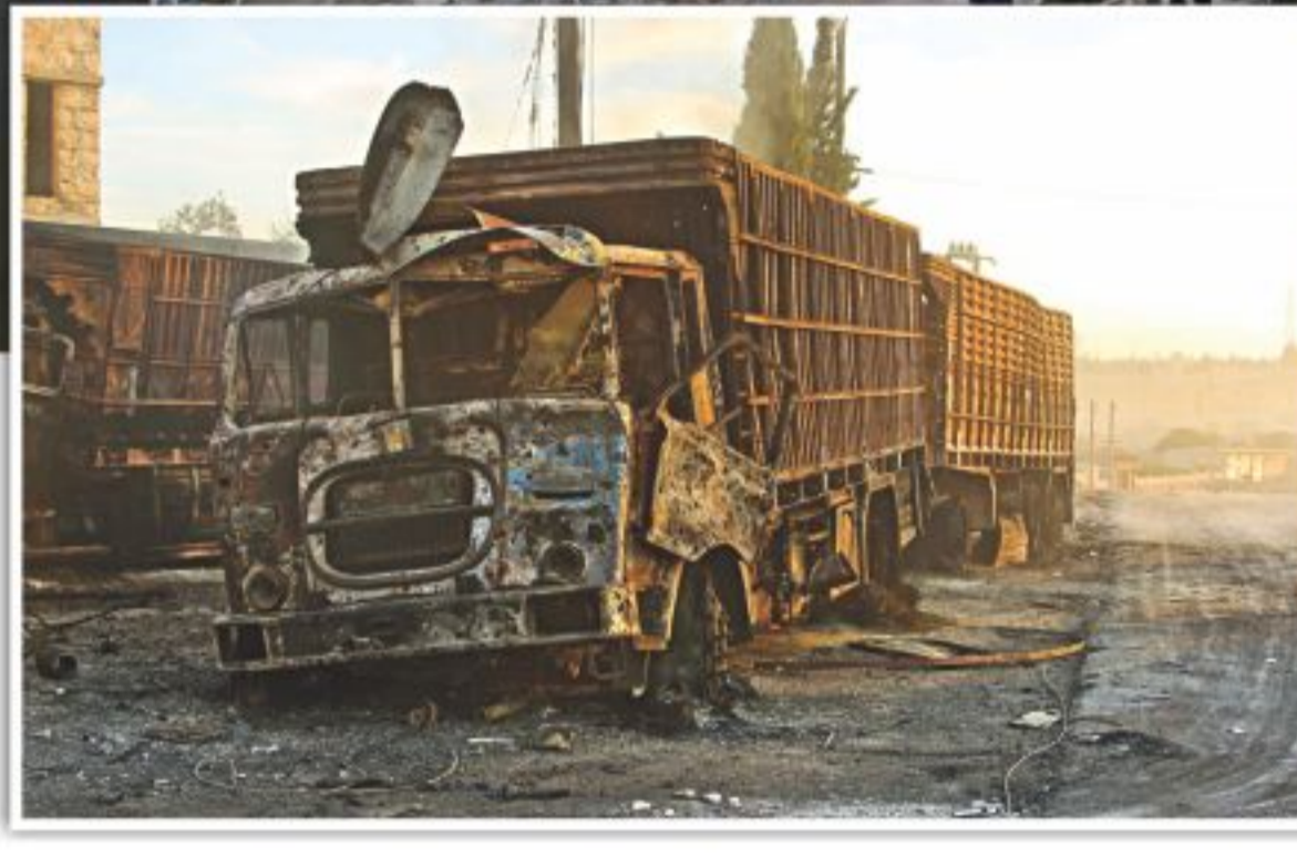
Aid is seen strewn across the floor in the town of Orum al-Kubra on the western outskirts of the northern Syrian city of Aleppo yesterday, the morning after a convoy delivering aid was hit by a deadly air strike. A burnt down aid truck, inset, after the air strike. The UN said at least 18 trucks in the 31-vehicle convoy were destroyed en route to deliver humanitarian assistance to the hard-to-reach town.