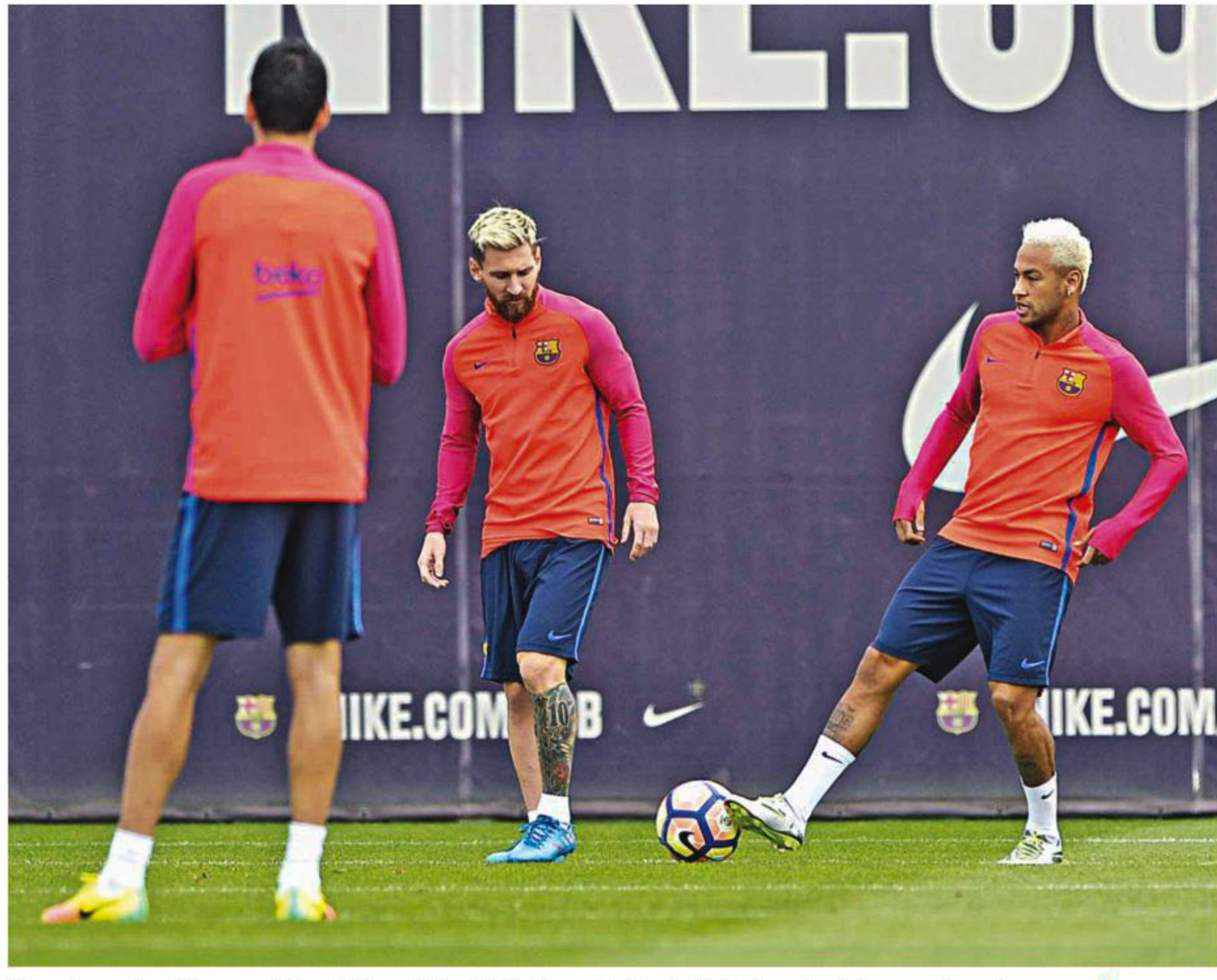
Barcelona stars Neymar (R) and Lionel Messi (C) play with the ball during a training session at the Sports Centre Joan Gamper in Sant Joan Despi yesterday.

"He is a player that offers us that option and hopefully he maintains that ambition that allows him to aspire to more every day."