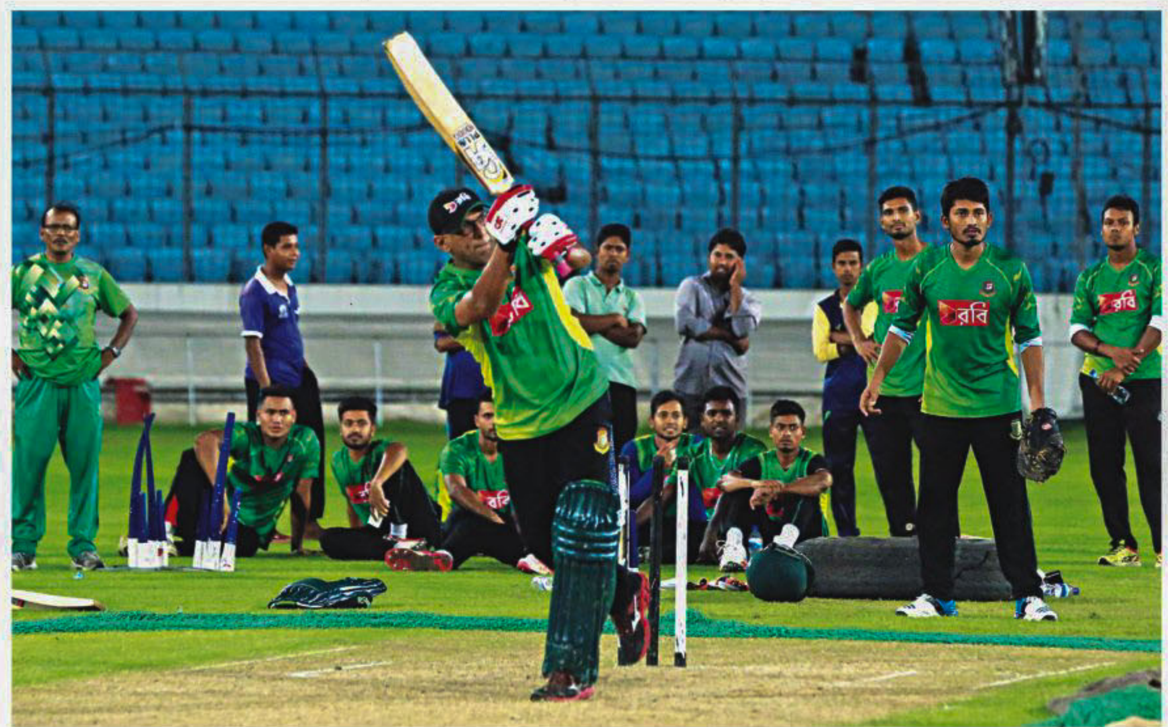
THIS IS HOW IT'S DONE: Bangladesh coach Chandika Hathurusingha has a captive audience in the Tigers batsmen as he revisits his playing days with a casual hit on the centre wicket of the Sher-e-Bangla National Stadium during the practice session yesterday.