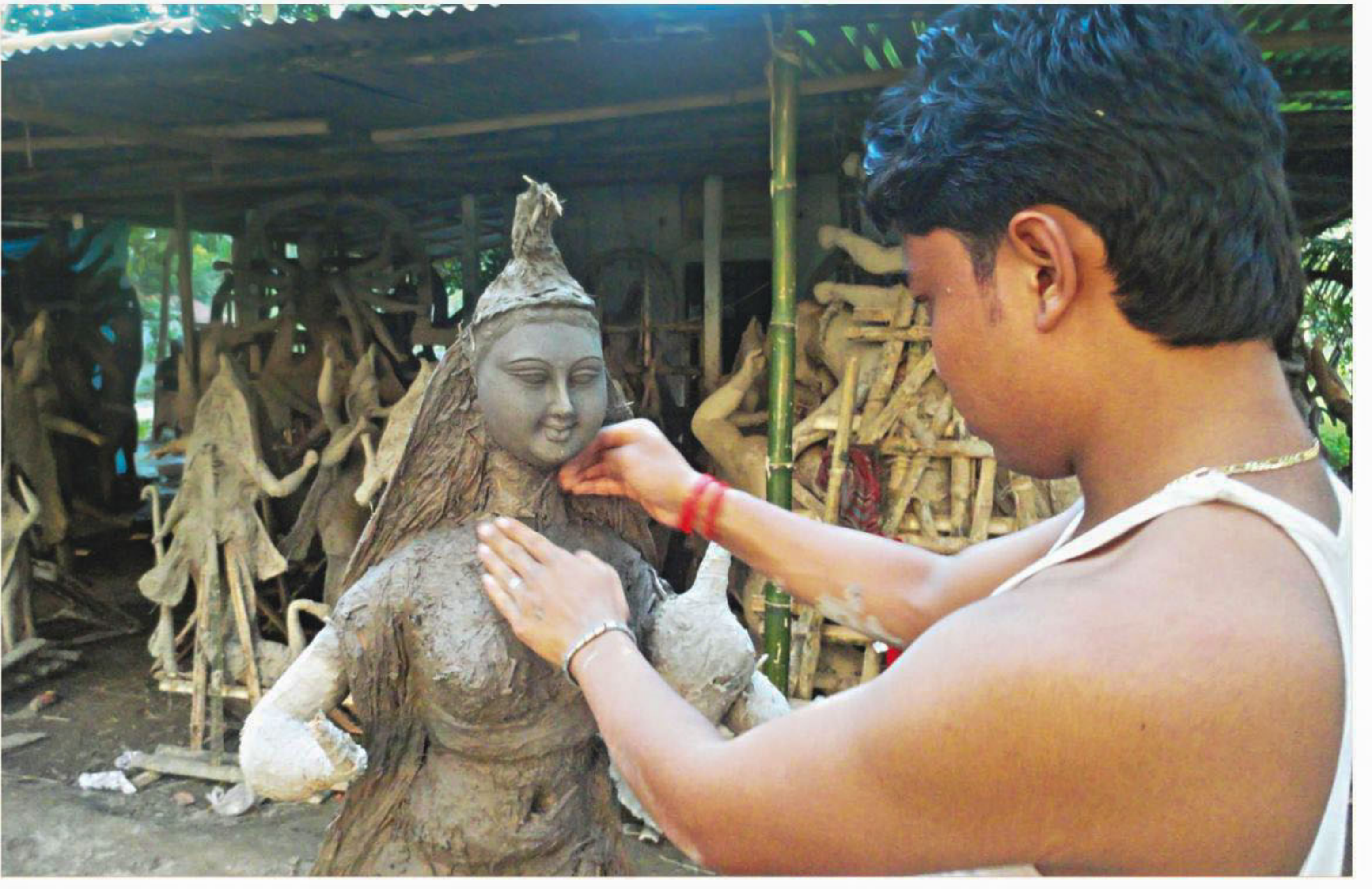
An artisan makes the idol of a deity at a Durga temple of Saptana village in Lalmonirhat district as preparations are on to celebrate Durga Puja, the biggest religious festival of the Bangali Hindus, early next month.