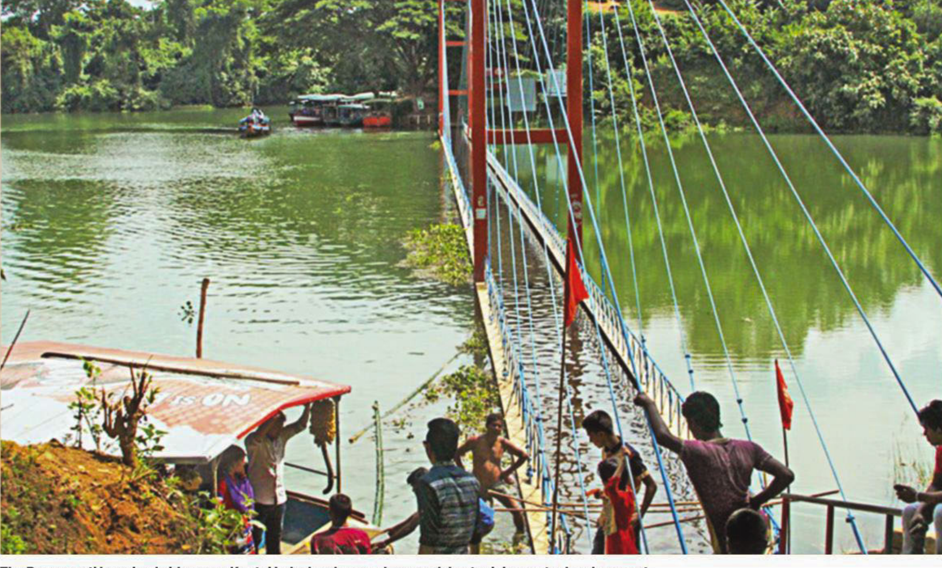
The Rangamati hanging bridge over Kaptai Lake has been submerged due to rising water level, prompting the authorities to suspend movement on it from Sunday.