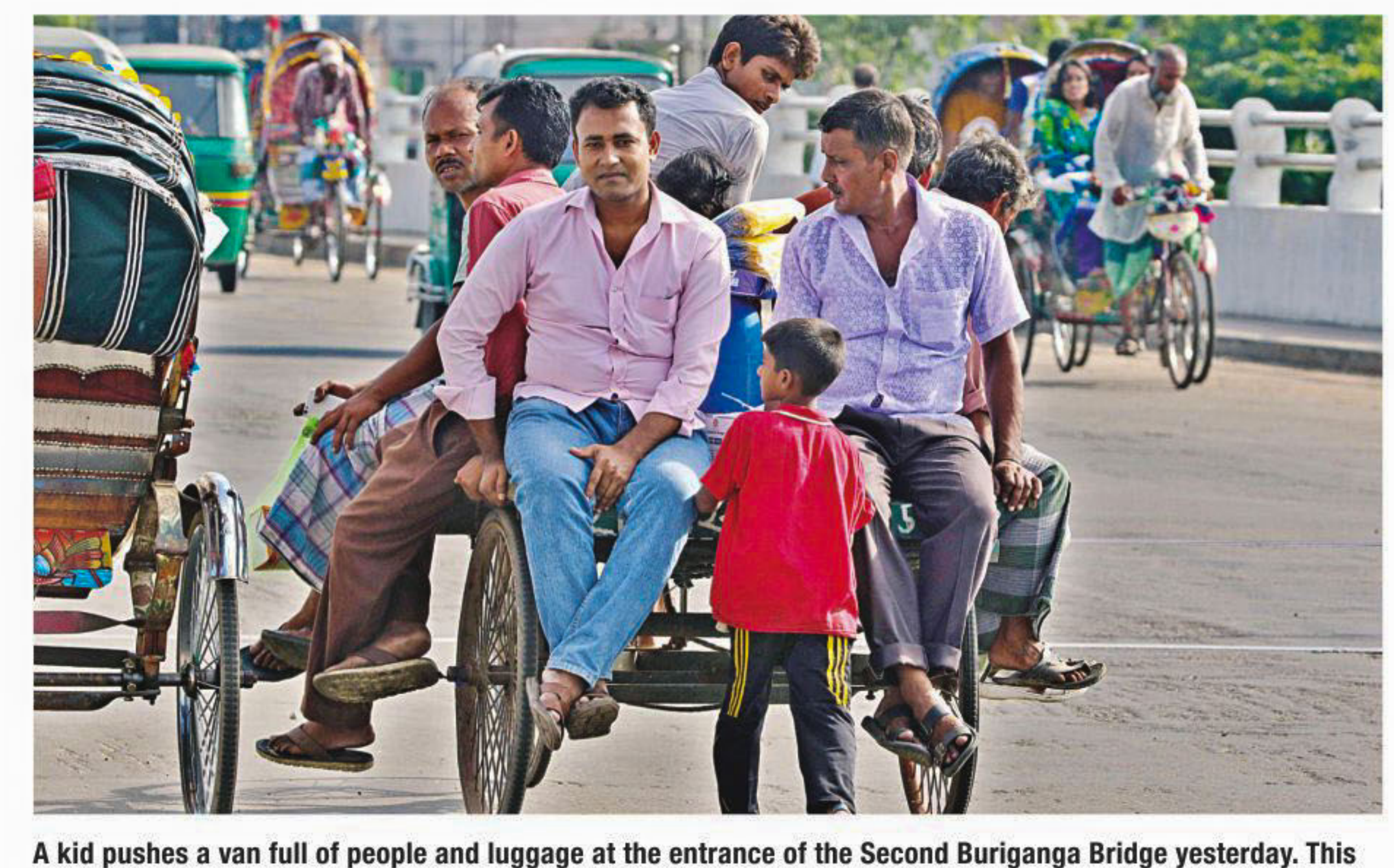
A kid pushes a van full of people and luggage at the entrance of the Second Buriganga Bridge yesterday. This is what he does for a living. The boy makes Tk 50 to Tk 60 per day by helping vehicles and people bigger than him climb the ramp of the bridge. There are many kids like him in the area who push these heavily loaded non-motorised vehicles to support their families or themselves.

STAFF CORRESPONDENT, Rajshahi Education Minister Nurul Islam Nahid yesterday warned that school and college teachers would lose jobs if they fail to recognise their students. A teacher who does not recognise his students has no right to be in the profession, Nahid said at a meeting with heads of different educational institutes in Rajshahi Medical College auditorium. "We are collecting information about such teachers. We will cut the teacher's name from the monthly pay order (MPO) list or sack him if he is a government service holder", Nahid said. If it becomes difficult for teachers to remember their huge number of students, they should admit an adequate number of students so that they can attend them and maintain contacts with their guardians, he added. Nahid further said students are being misguided and dragged into militancy due to a lack of close relation with their teachers who could provide them proper guideline. Rajshahi Education Board organised the meeting.