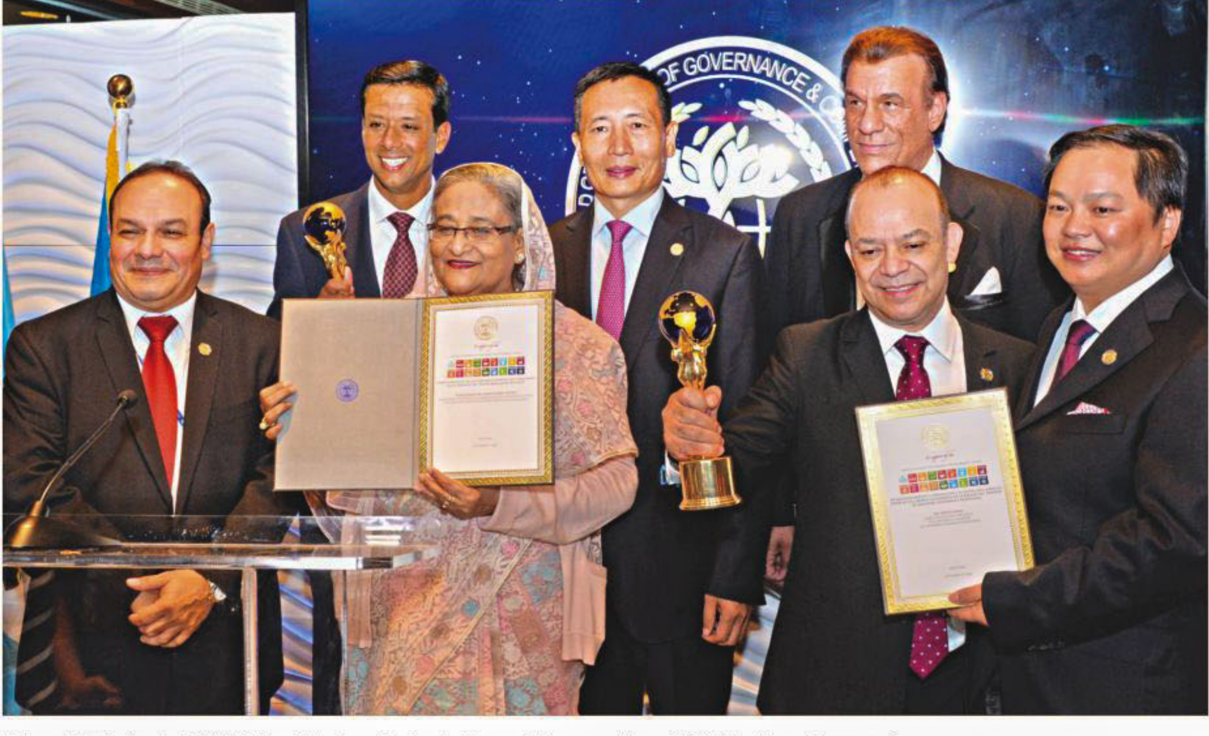
Prime Minister's ICT Affairs Adviser Sajeeb Wazed Joy receives "ICT for Development Award, 2016" at the Hotel Millennium in New York on Monday night. Prime Minister Sheikh Hasina is also present among others.