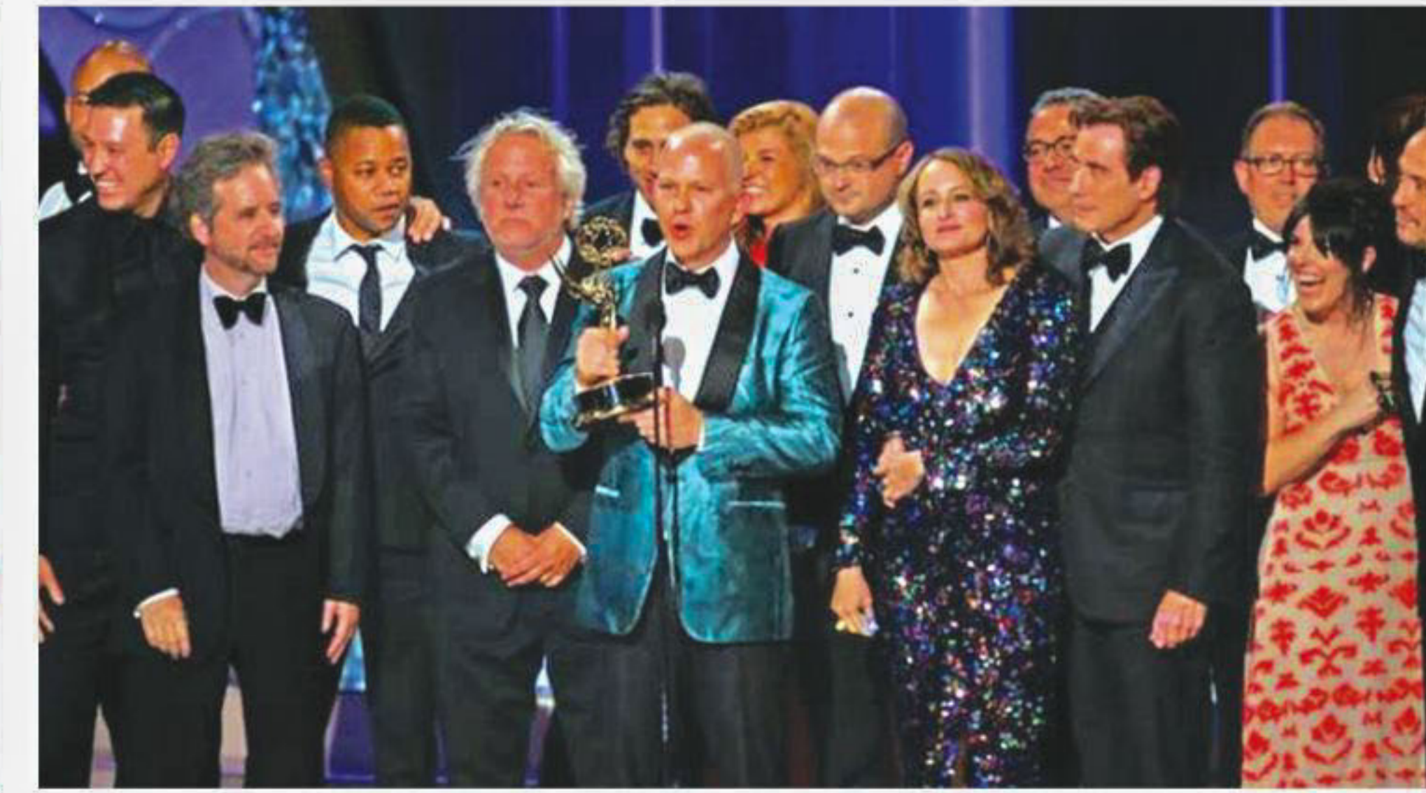
The cast and crew of "Game of Thrones" (top); Julia Louis-Dreyfus with her sixth consecutive best actress award (left) and the "People v. OJ Simpson" cast celebrate.