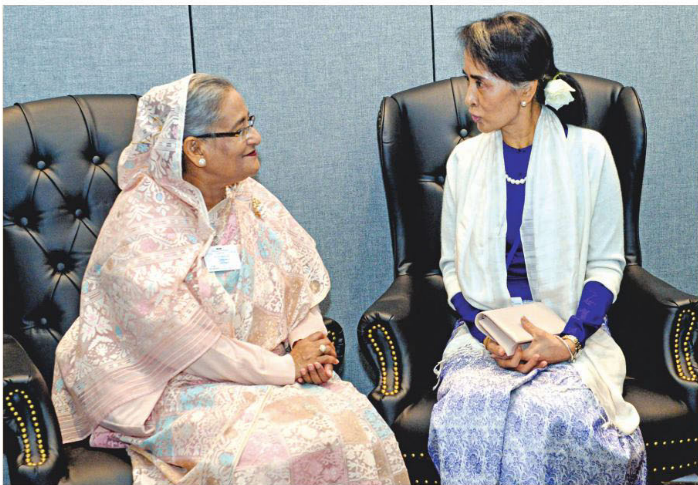
Prime Minister Sheikh Hasina talking to Myanmar leader Aung San Suu Kyi at the United Nations headquarters in New York yesterday.