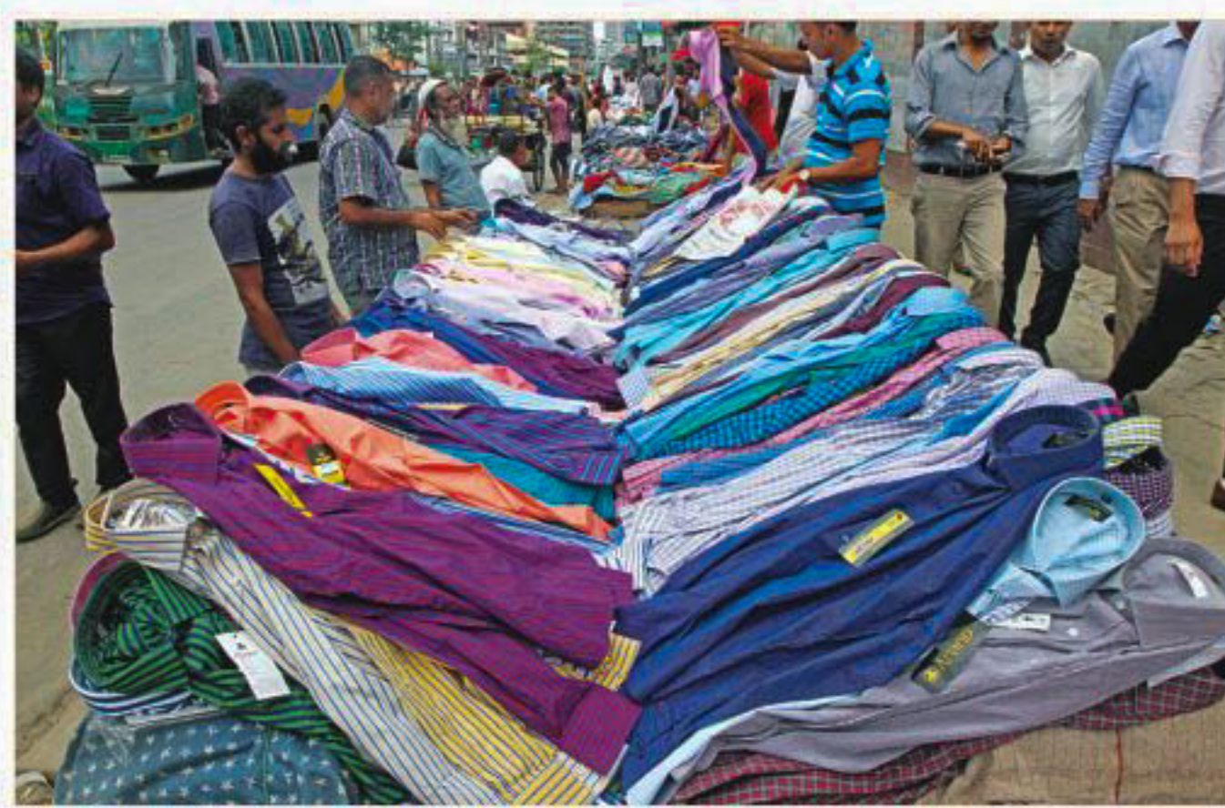
Life is back to normal in the capital, as Dhaka once again sees traffic congestion yesterday afternoon with people heading home after work (left), while many are still on their way back after enjoying Eid with their families at their village homes (top right), whereas it is business as usual for the vendors who occupy the city footpaths and streets hoping to attract customers. The photos were taken from the capital's Farmgate area, Kawkhali Launch Terminal in Pirojpur and the capital's Motijheel area.