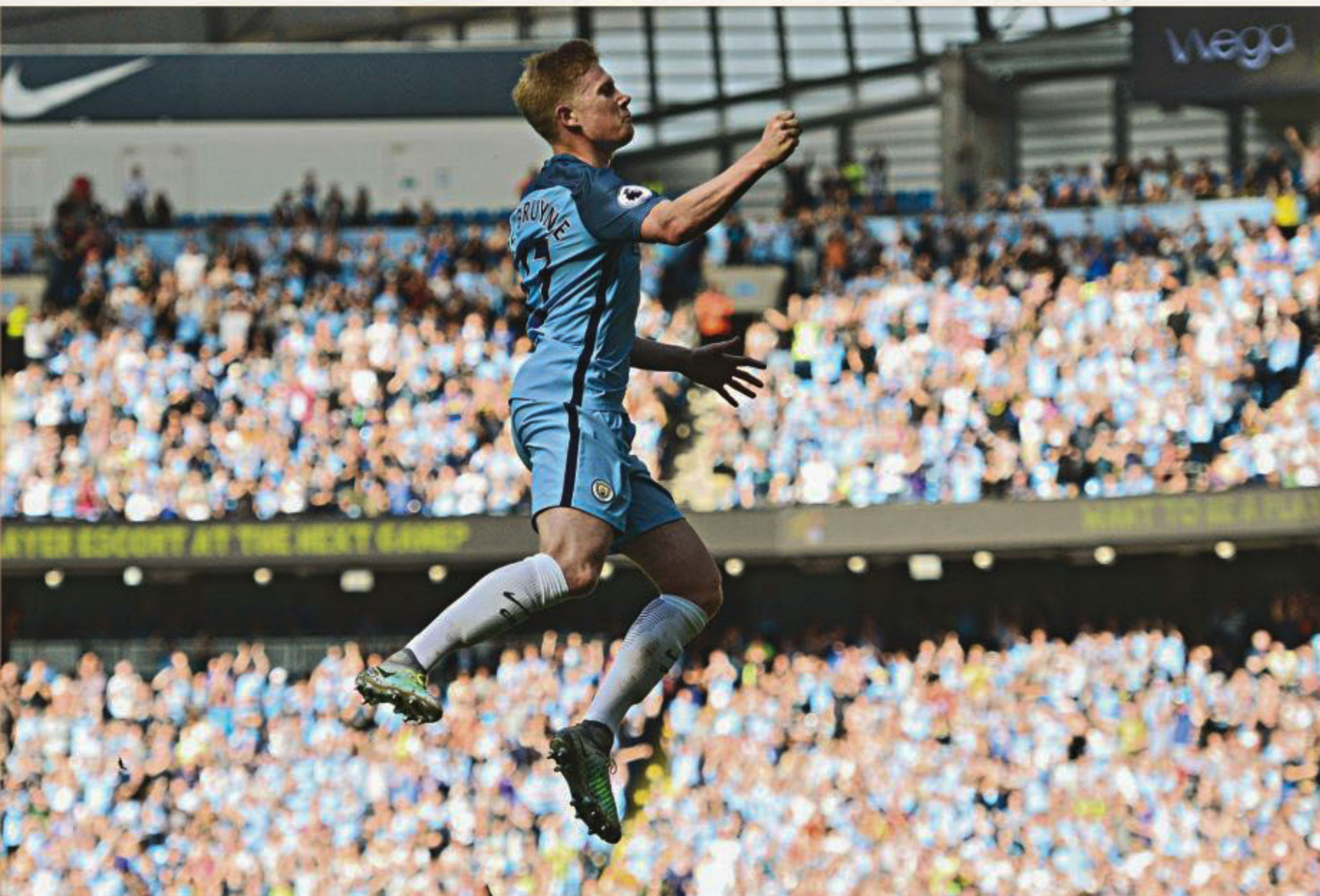
Manchester City midfielder Kevin De Bruyne jumps for joy after scoring the opening goal against Bournemouth during their Premier League clash at the Etihad Stadium yesterday.