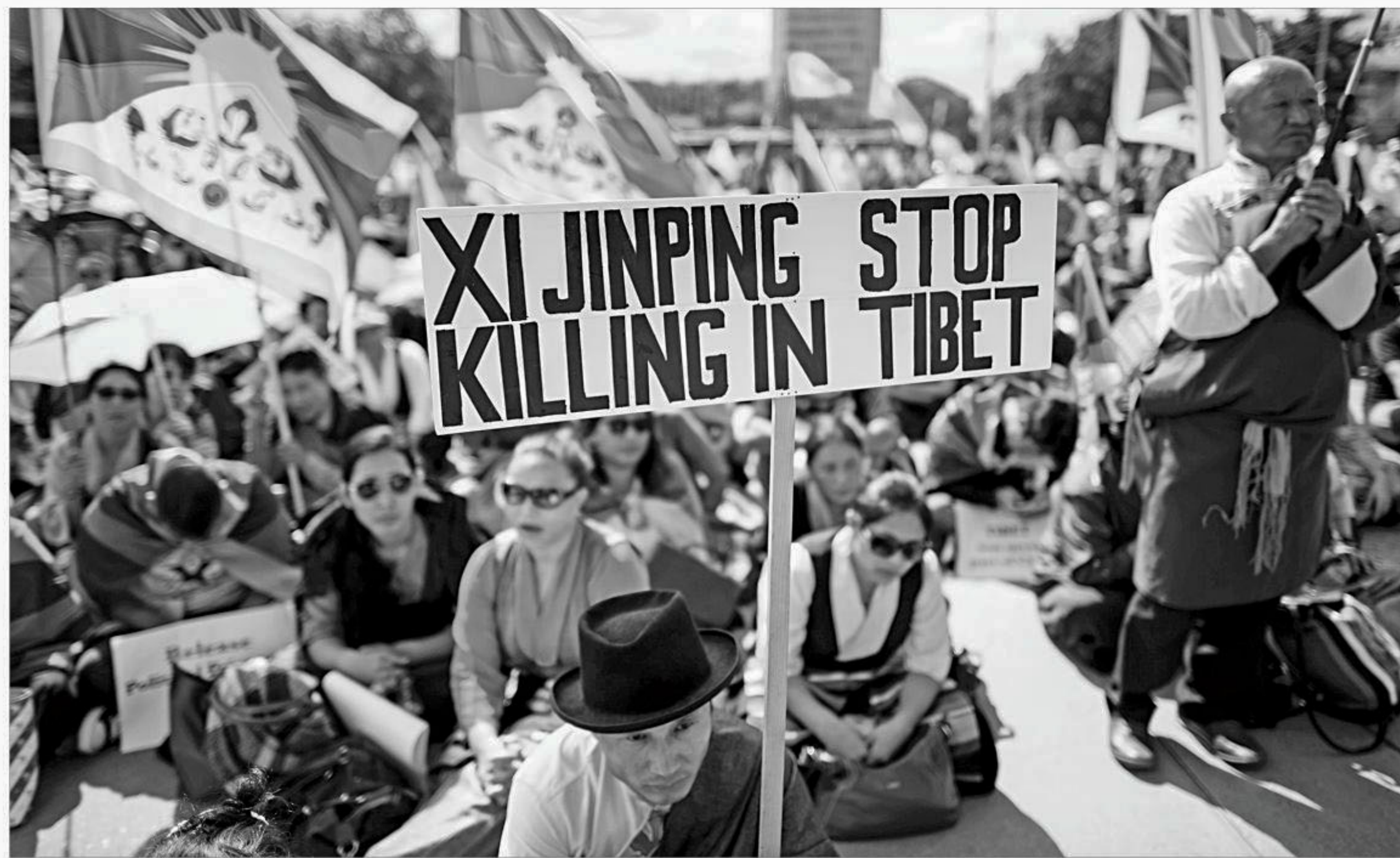
A protester holds a placard reading 'Xi Jinping stop killing in Tibet' during a rally involving members of the Tibetan and Uyghur communities in Europe in front of the United Nations (UN) Office in Geneva yesterday. More than 400 persons took part to the demonstration.

DIPLOMATIC CORRESPONDENT The 66th birthday of Prime Minister Narendra Modi will be celebrated in Navsari district today. On the occasion, Modi would distribute assistive aids and appliances among 11,223 disabled people in Gujarat. On Modi's birthday, a new record will also be aimed at by providing hearing aids to 1,000 deaf people.