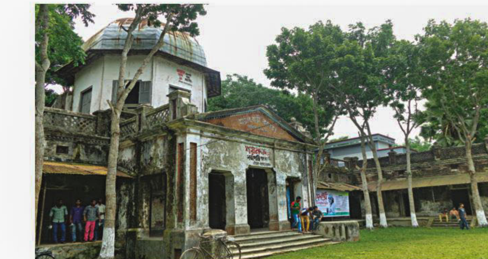
The dilapidated Atharabari Kacharibari, devoid of all its glory.