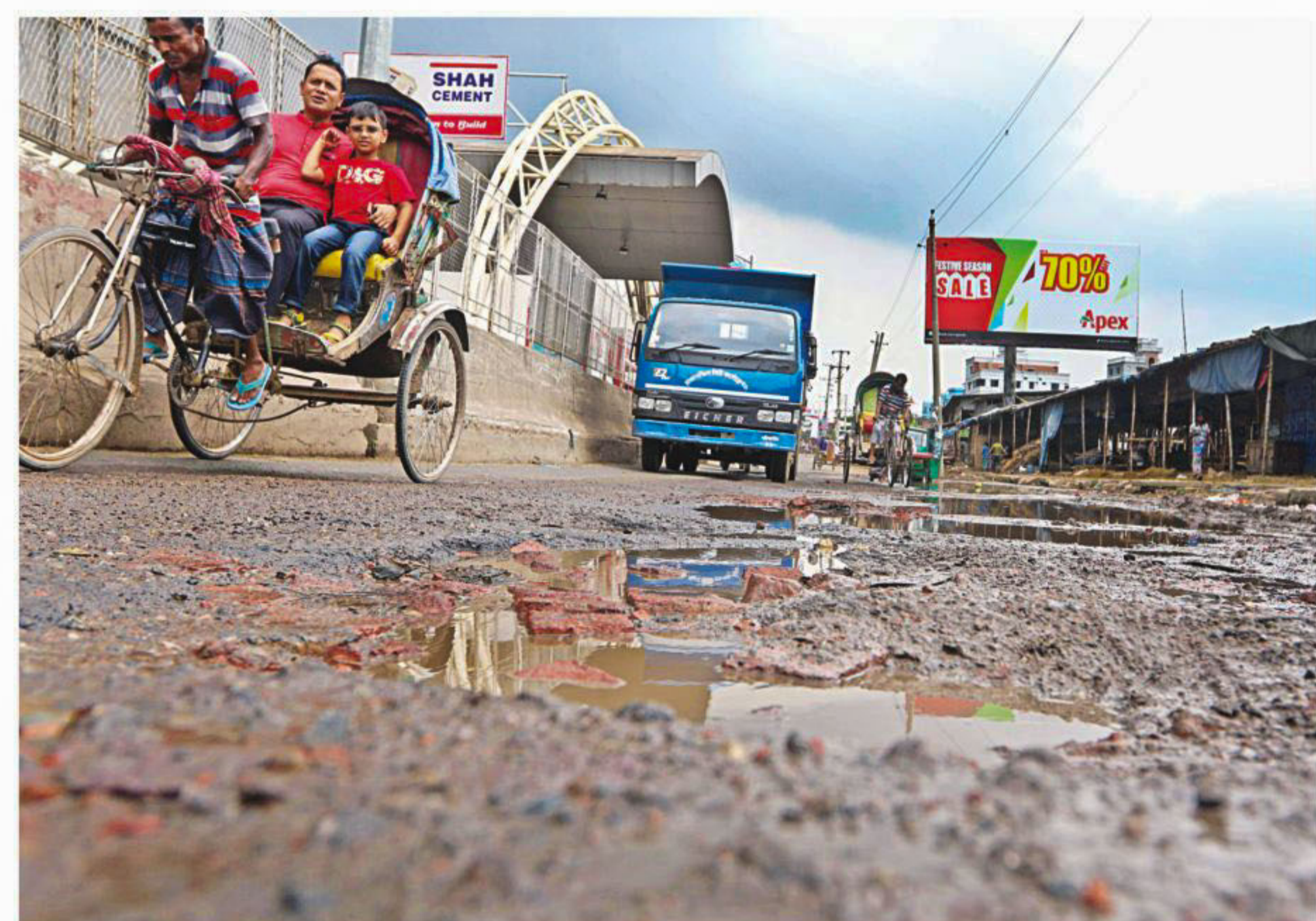
Vehicles pass through this road with craters filled with rainwater at Kazla in the capital's Jatrabari yesterday.

Some 199 sea robbers have so far been arrested with surrender of five gangs and 612 firearms and 16,451 rounds of bullet have been seized since the inception of Rab.