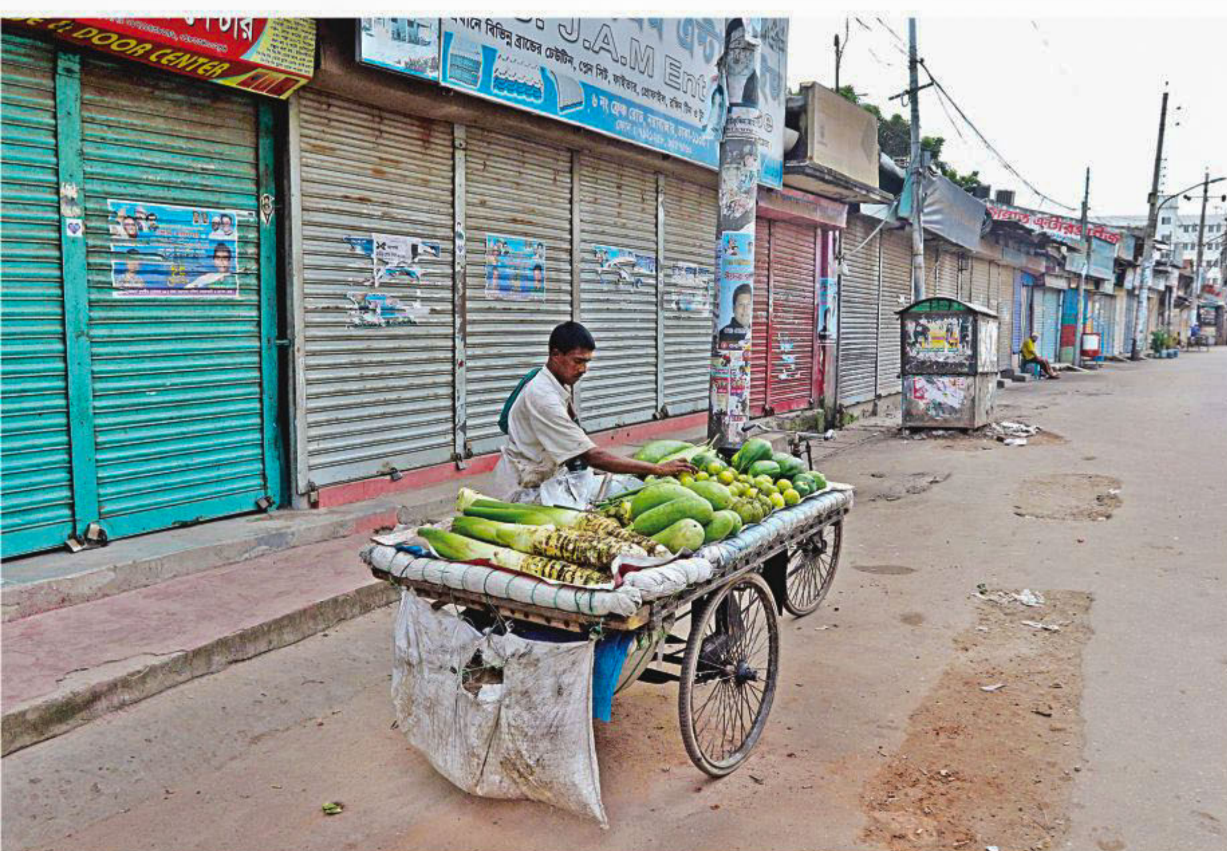
A vegetable vendor stands idly on an empty street with stores remained closed yesterday as people are yet to return to work after spending time with families during the Eid holidays. The photo was taken in the capital's Naya Bazar area.