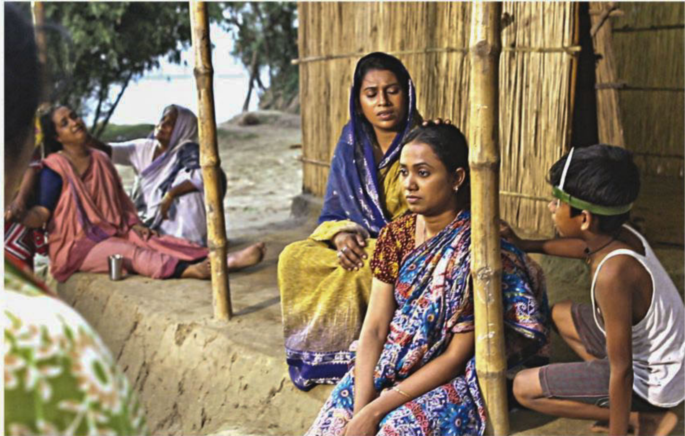
A scene from the film.

12-year old singer-ukulele player Grace VanderWaal has won talent show "America's Got Talent", pushing off stiff competition from a variety of talented performers. She is now Vegas bound, where she will headline the PH Showroom at Planet Hollywood Resort & Casino on Oct. 27, 28 and 29, according to a statement. The Season 11 winner -- who will also collect a $1 million grand prize -- will be joined by the AGT runner-up, mentalist magicians The Clairvoyants, and prop mime Tape Face for all three shows. VanderWaal was a frontrunner from her very first audition, when she played her original "I Don't Know My Name". Her performance excited judge Howie Mandel, who propelled her into the competition by hitting the Golden Buzzer. As a special treat, the New Yorker -- who purchased her ukulele with birthday money for her 11th birthday -- performed a reprise of her audition song, earning praise from special guest Stevie Nicks. Source: Billboard