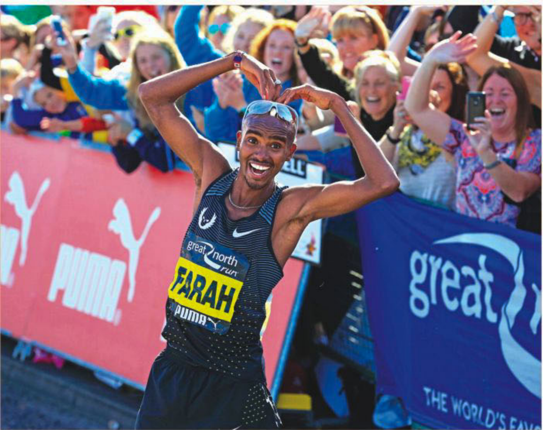
After his double-double in the Olympics, British long-distance runner Mo Farah secured an unprecedented third on the trot in the Great North Run on Sunday.