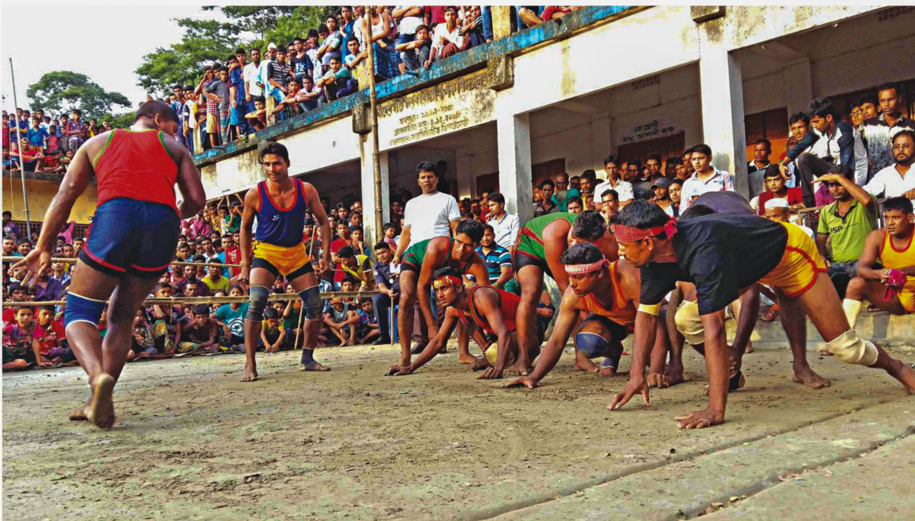
This picture taken on Friday at the Goshershat Govt Primary School in Pirojpur district shows how popular ha-du-du (kabaddi) is in the rural areas of the country. It's not just the players who have fixed their focus on the raider but the whole audience which included a huge number of fans who even took the risk of sitting on the roof of the dilapidated one-storey structure.