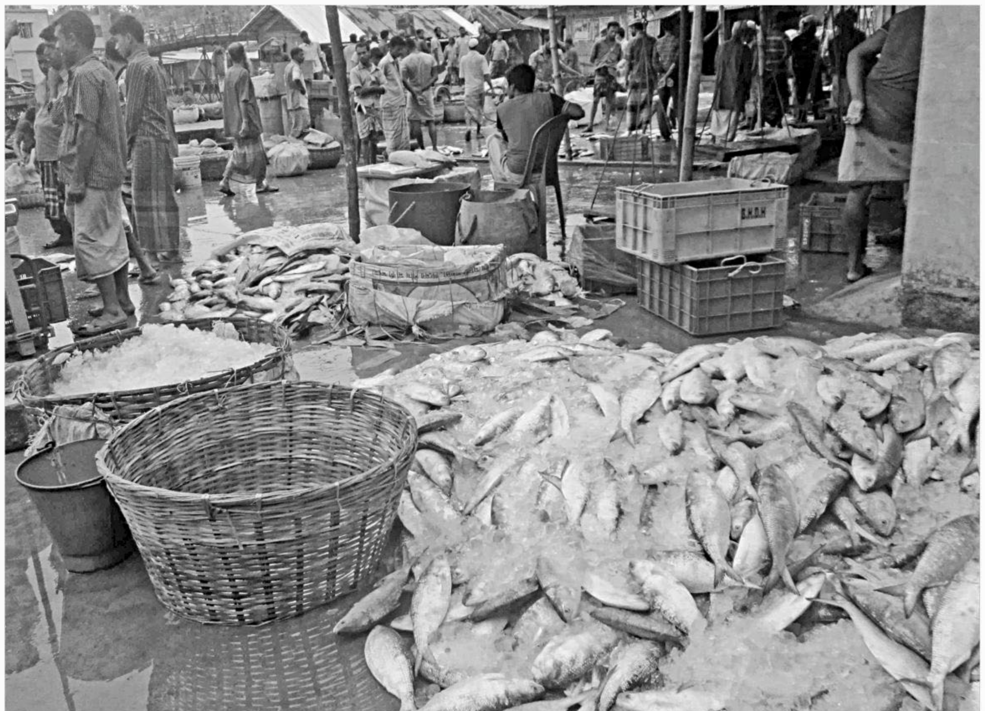
Huge quantities of hilsa arrive at Badura fish landing station in Pirojpur Sadar upazila following good catches of the popular fish in the Bay this season.