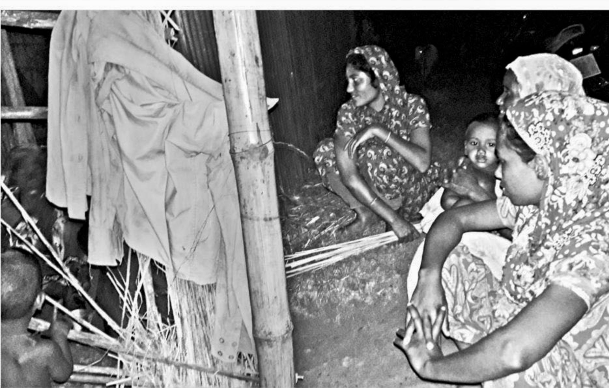
Like these people, many victims of recent flood and erosion in char and low lying areas of Lamonirhat district are far from being happy a couple of days before the Eid-ul-Azha, as they are struggling to manage bare necessities of daily life. The photo was taken from Char Kalmati village in Lamonirhat Sadar upazila.

Seeking anonymity, several teachers alleged that the education officer sends the papers late to the bank every month.