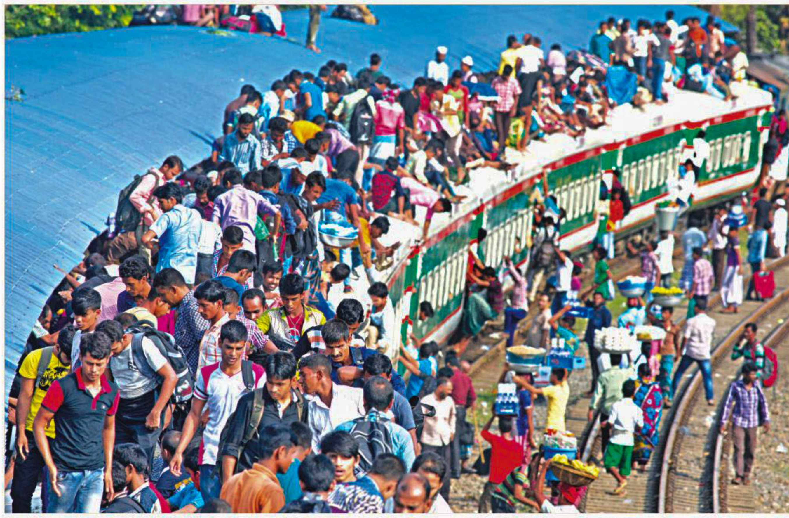
Like every other year, people leaving the capital to celebrate the Eid vacation travel on the train roof at the Airport Railway Station yesterday. Travelling on train roof can lead to a serious accident anytime. Yesterday, at least 40 passengers suffered injuries falling off the roof of a train in Sirajganj. Top right , one of the victims lying on the ground. Bottom right , a ladder is being used to climb to the roof of a train at Sreepur station in Gazipur.