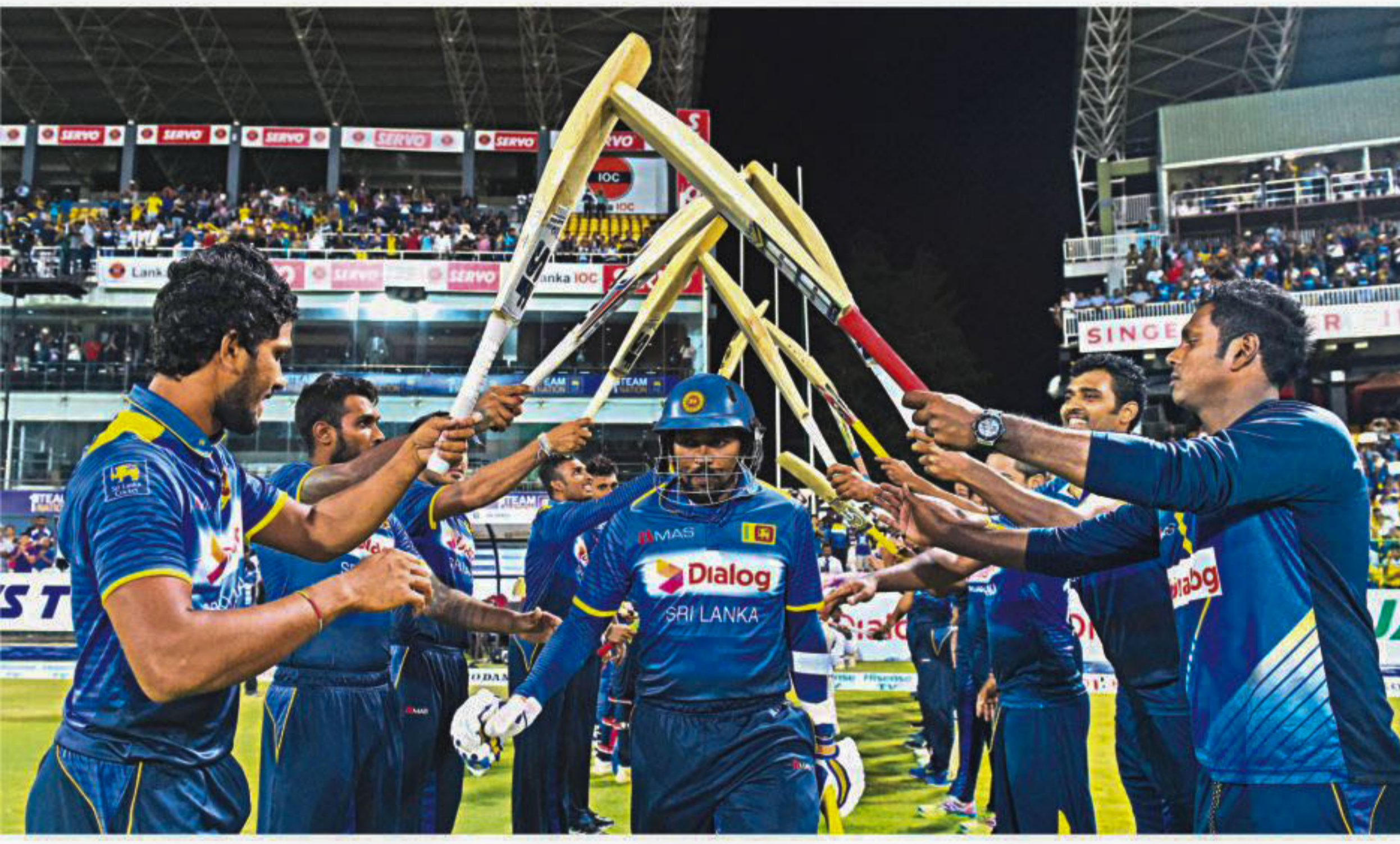
Ahead of his final game for his country, Sri Lankan stalwart Tillakaratne Dilshan was given a guard of honour as he made his way onto the pitch in the second and final T20I against Australia in Colombo yesterday.

Another opener Mohammad Hafeez was also left out after he returned home mid-way through the one-day series in England with calf and knee injuries.