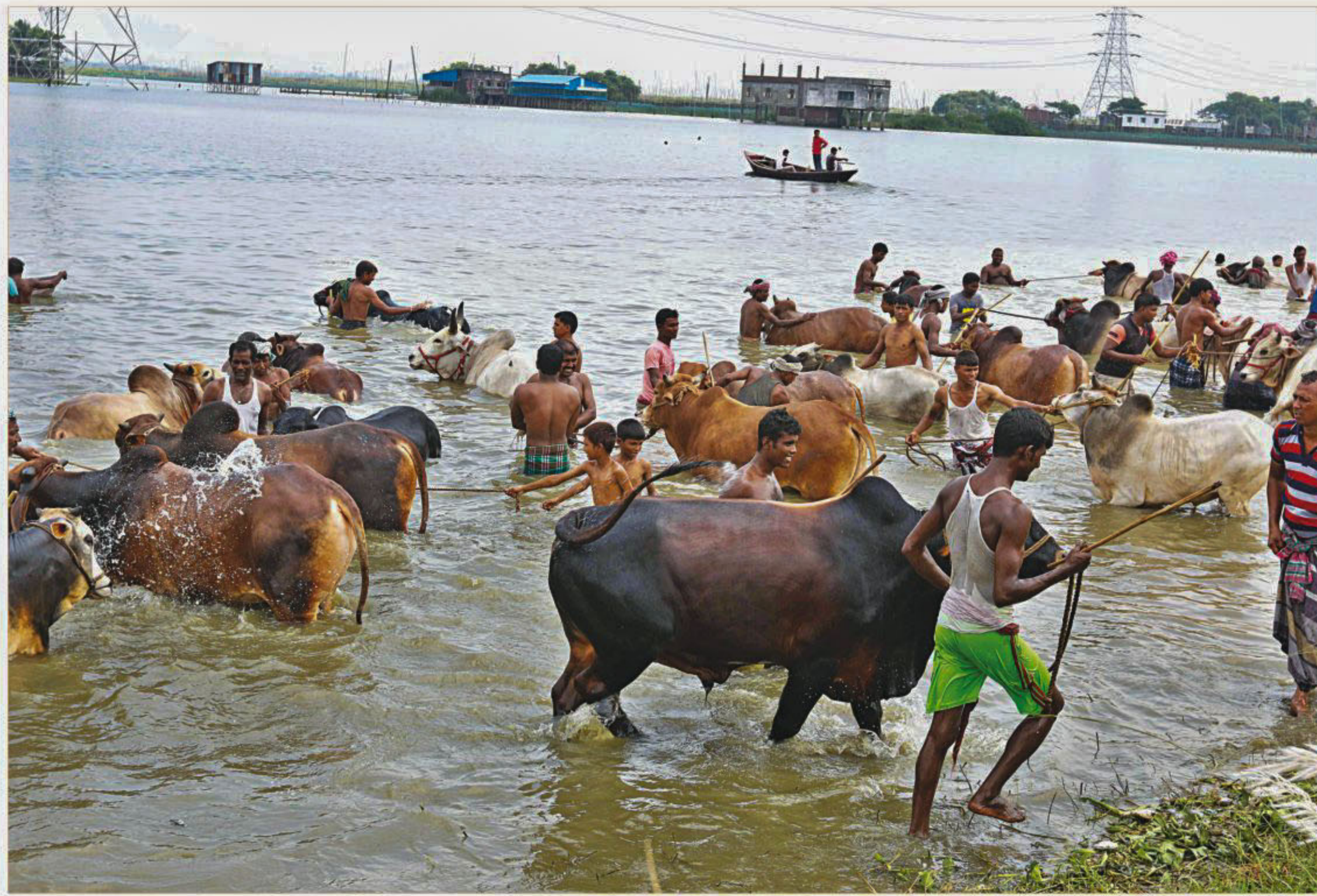
Traders wash cattle in the river Balu in the capital's Aftabnagar area yesterday before taking them to cattle market to sell them as sacrificial animals for the Eid-ul-Azha.