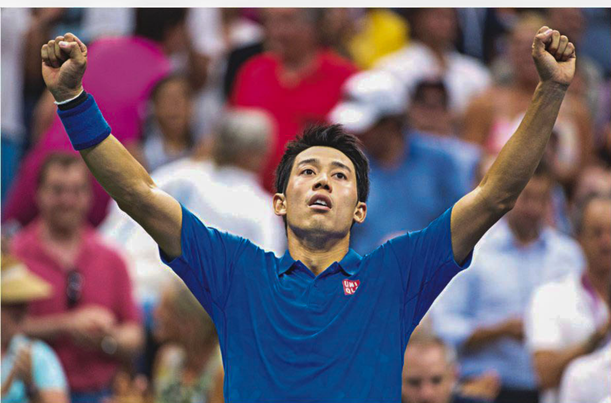
Kei Nishikori of Japan celebrates his victory over Andy Murray of Great Britain in their US Open men's singles quarterfinals at Flushing Meadows on Wednesday.

Sri Lanka v Australia Second T20 Live from 7:30pm