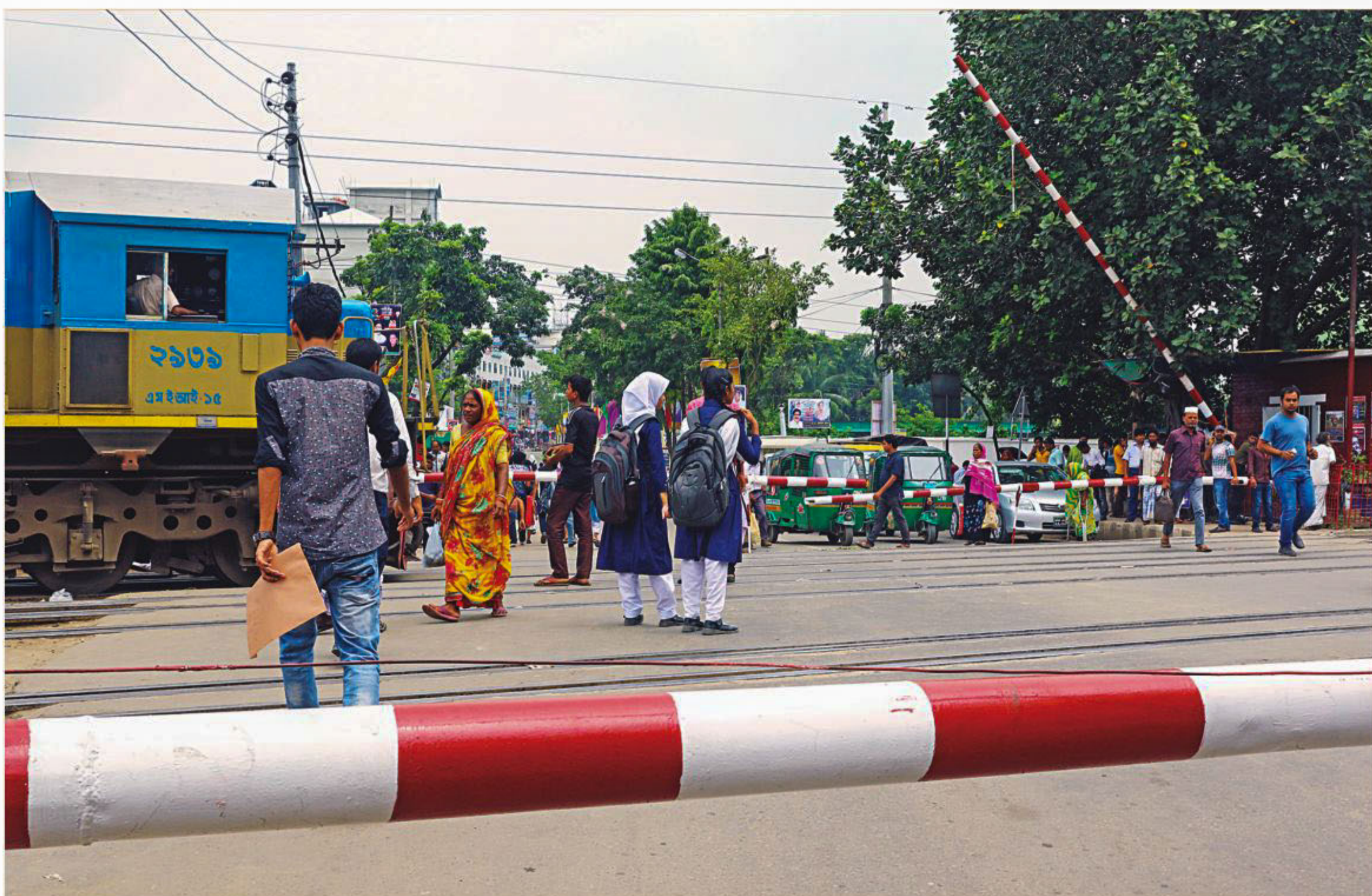
Despite a train fast approaching, schoolgirls and pedestrians cross a level crossing, disregarding the barriers on the both sides, putting their lives in peril. The photo was taken in Haji Camp area opposite Hazrat Shahjalal International Airport in the capital yesterday.