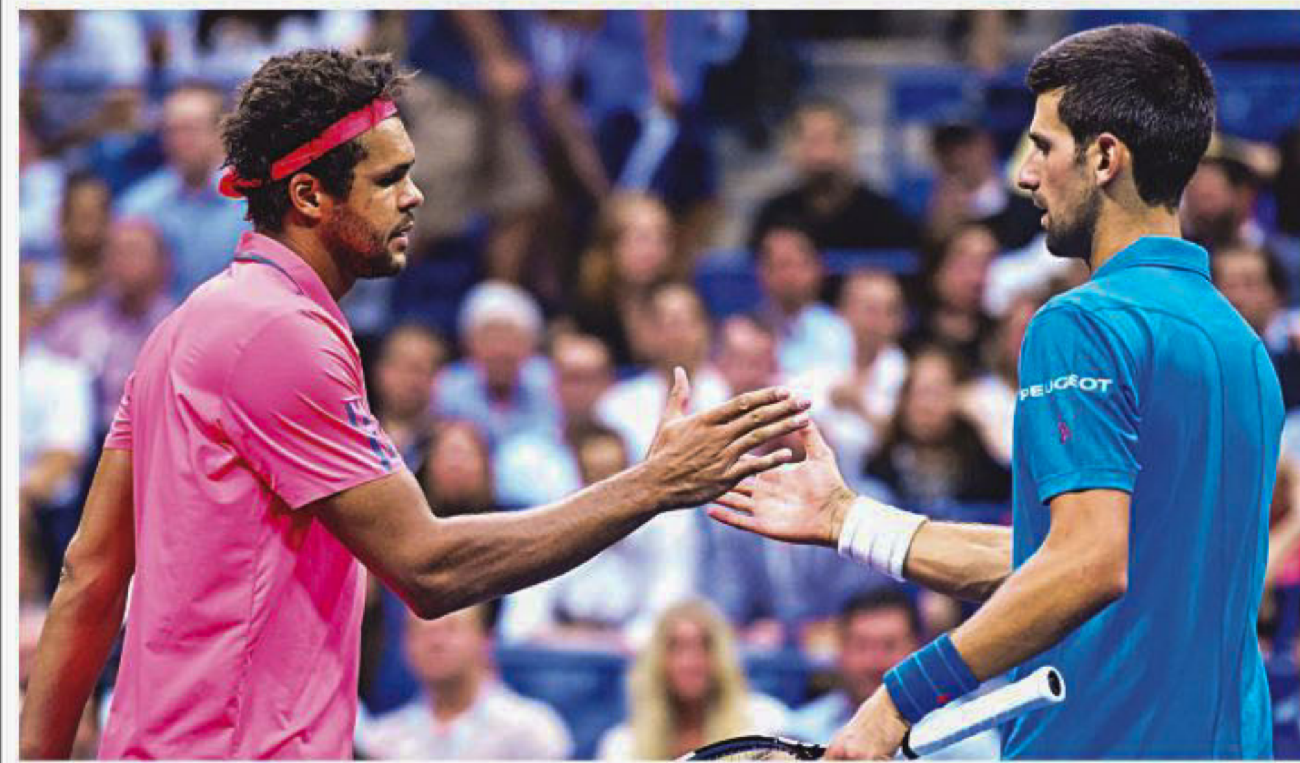
Jo-Wilfried Tsonga (L) shakes hands with Novak Djokovic after being forced to retire due to injury in their US Open men's singles quarterfinals at Flushing Meadows on Tuesday.

The two-time runner-up, ranked at a lowly 74 after an injury-hit campaign, eased to a 6-0, 6-2 win and will face second seed Angelique Kerber for a place in Saturday's championship match.