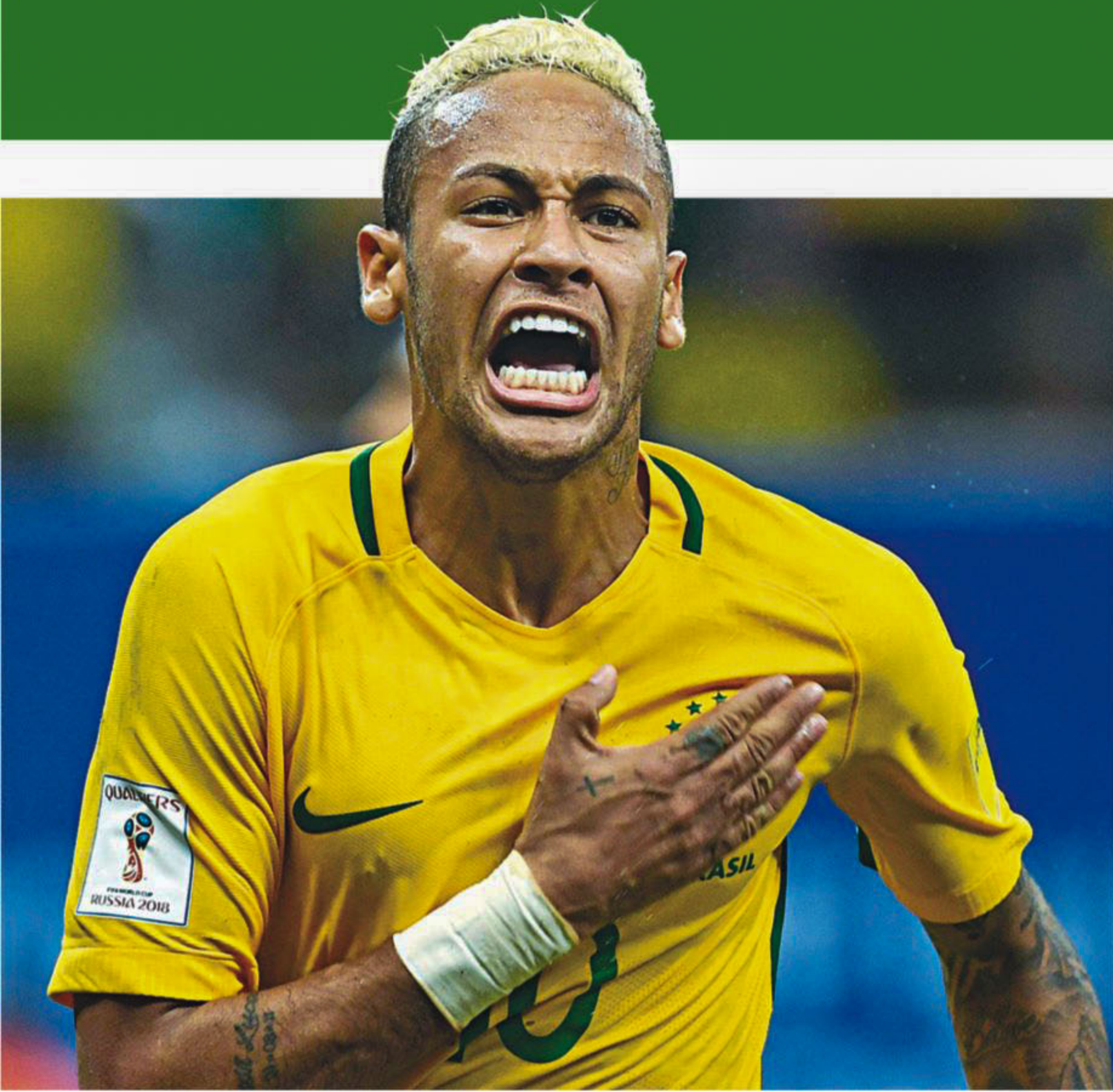
Brazil star Neymar is ecstatic after scoring the winning goal against Colombia during their 2018 World Cup qualifier in Manaus on Tuesday.