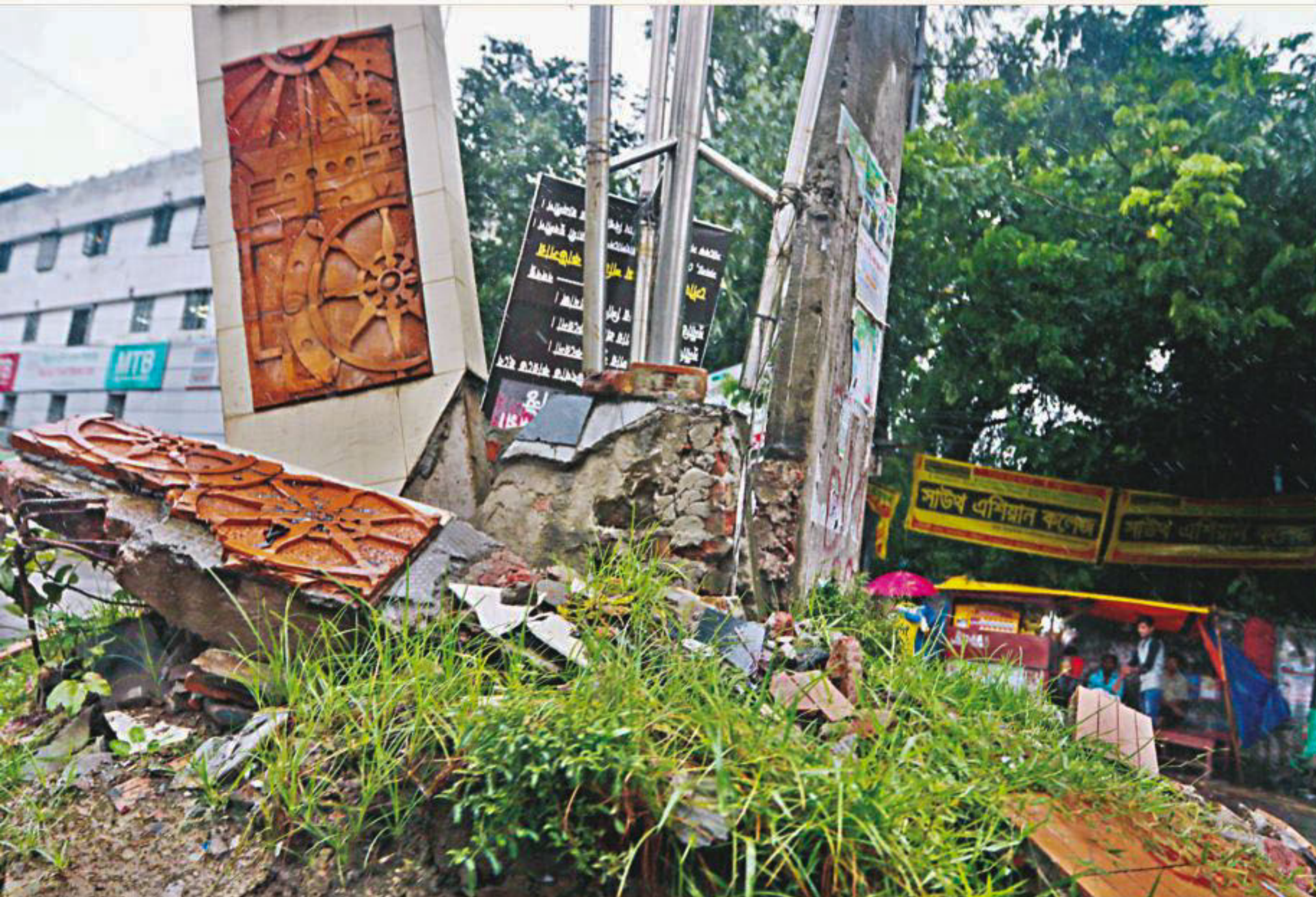
This battered and broken sculpture, at the entrance of the Kalurghat BISIC industrial area in Chittagong, was built to beautify the city. But due to incessant dumping of waste, lack of maintenance and indifference of the authorities concerned it remains in a derelict state. The photo was taken yesterday.