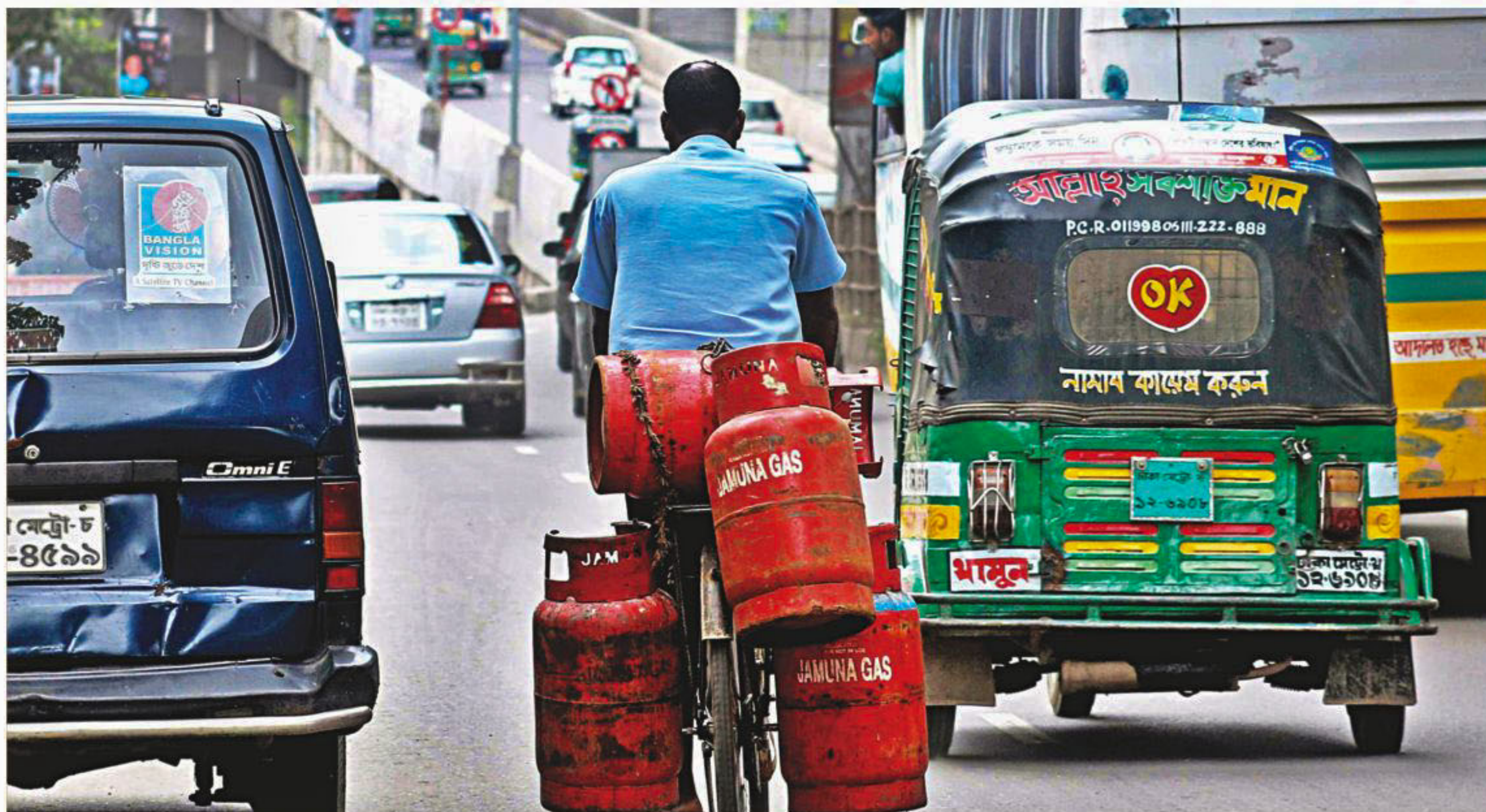
A man carries gas-filled cylinders hanging precariously on the sides and back of his bicycle tied with the help of flimsy chains in the capital's Tejgaon area amid traffic yesterday. This process of delivering the flammable cylinders not only puts the rider at risk but also could trigger a deadly disaster and needs immediate intervention of the authorities concerned to come up with a proper method of transporting these flammable cylinders.