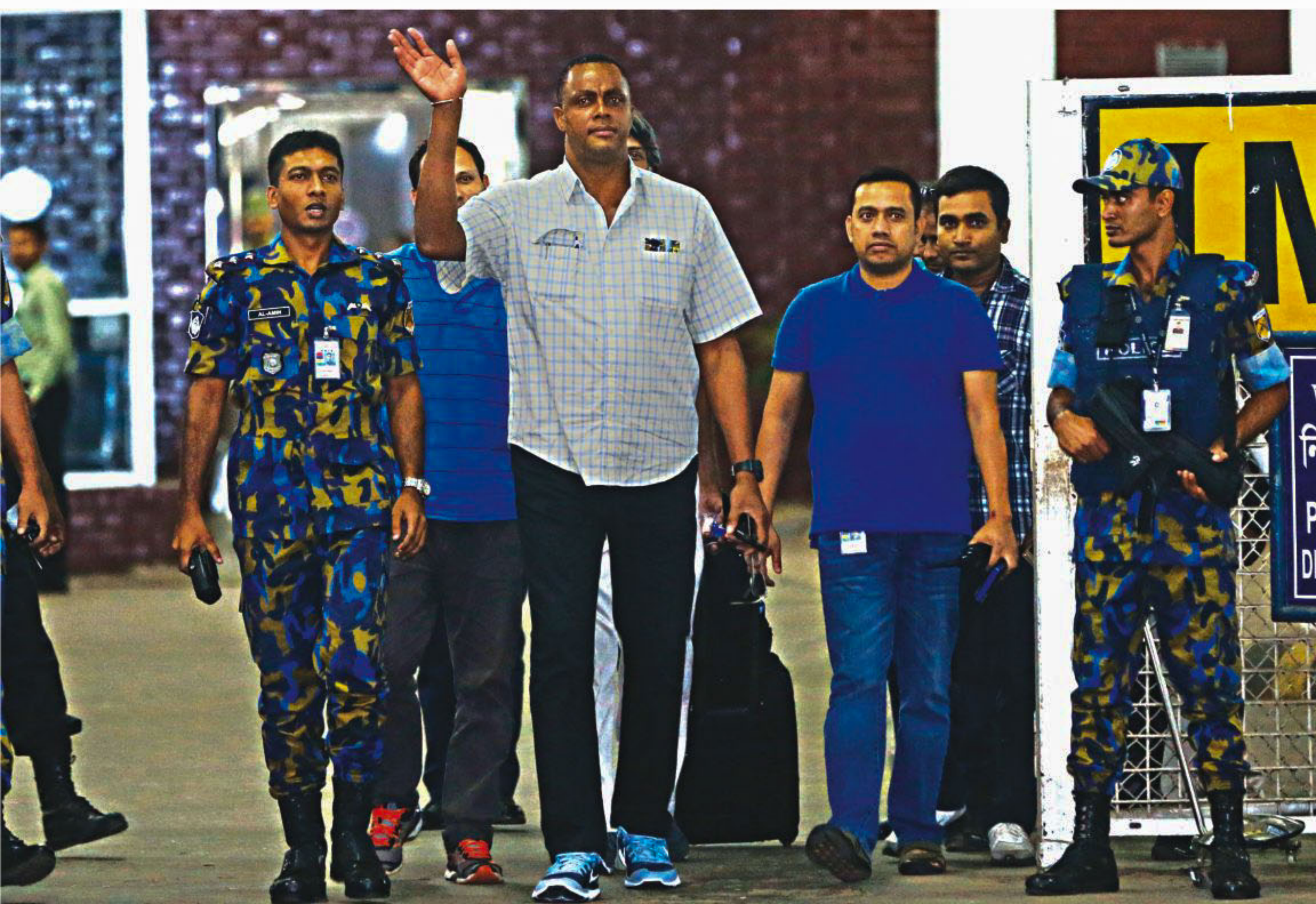
Bangladesh's new bowling coach Courtney Walsh waves upon his arrival at the Hazrat Shahjalal International airport last night.