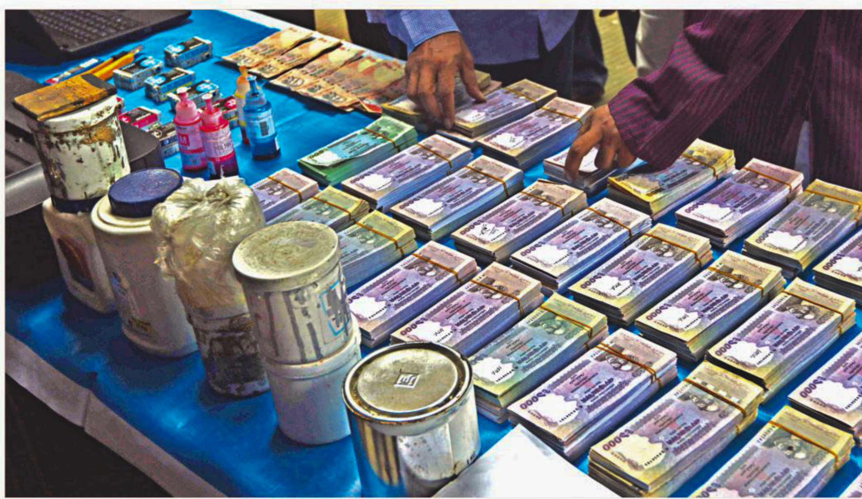
Fake notes and their printing materials are on display at the DMP media centre yesterday, a day after those were seized from the capital. Money counterfeiting gangs are active ahead of Eid-ul-Azha when people spend a lot for buying cattle.