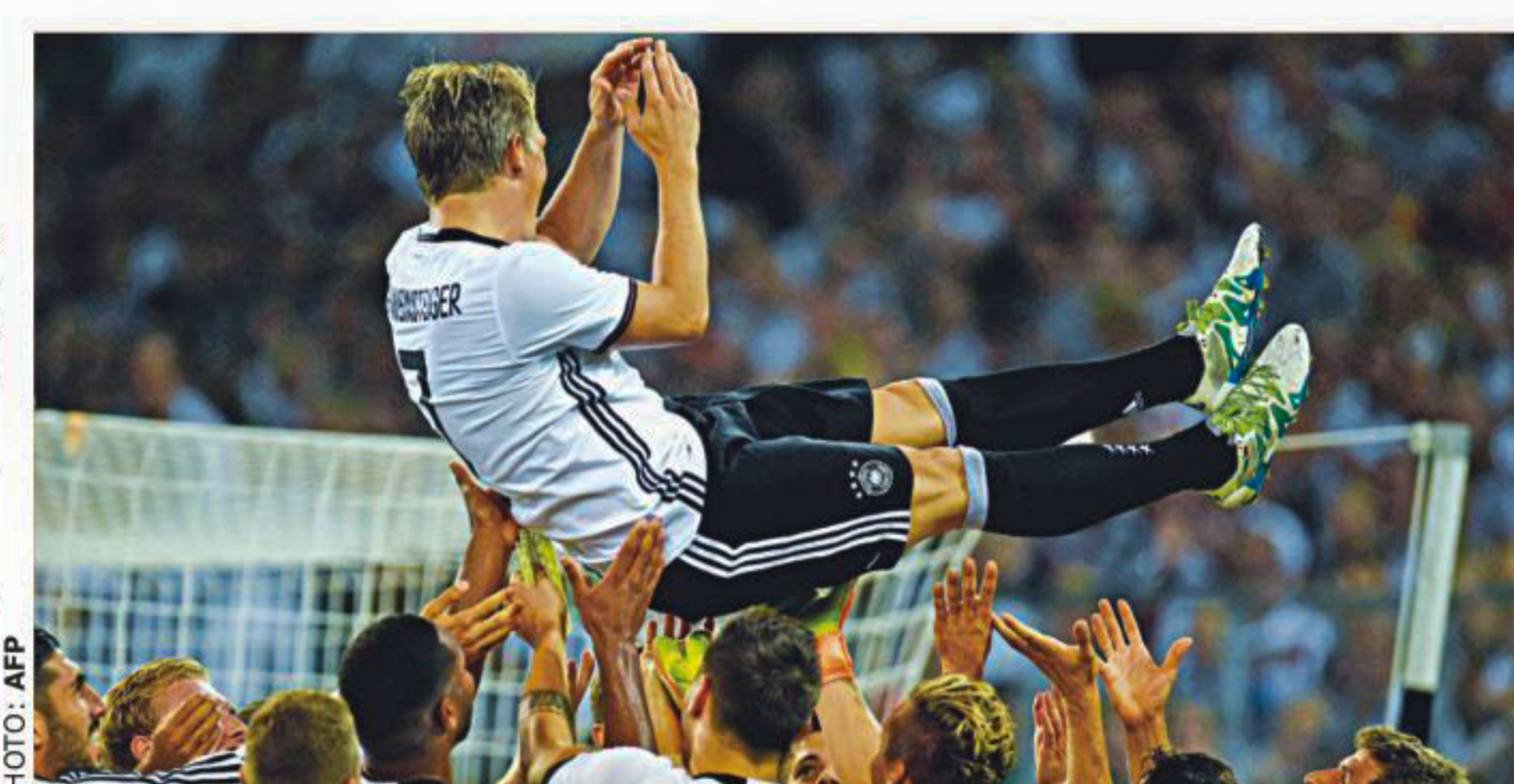
Germany midfielder Bastian Schweinsteiger is thrown in the air by his teammates after his last game for his country against Finland in Monchengladbach on Wednesday.

The 32-year-old, who played a key role as part of the 2014 World Cup-winning squad, is fourth on the all-time list of appearances for Germany and has played.