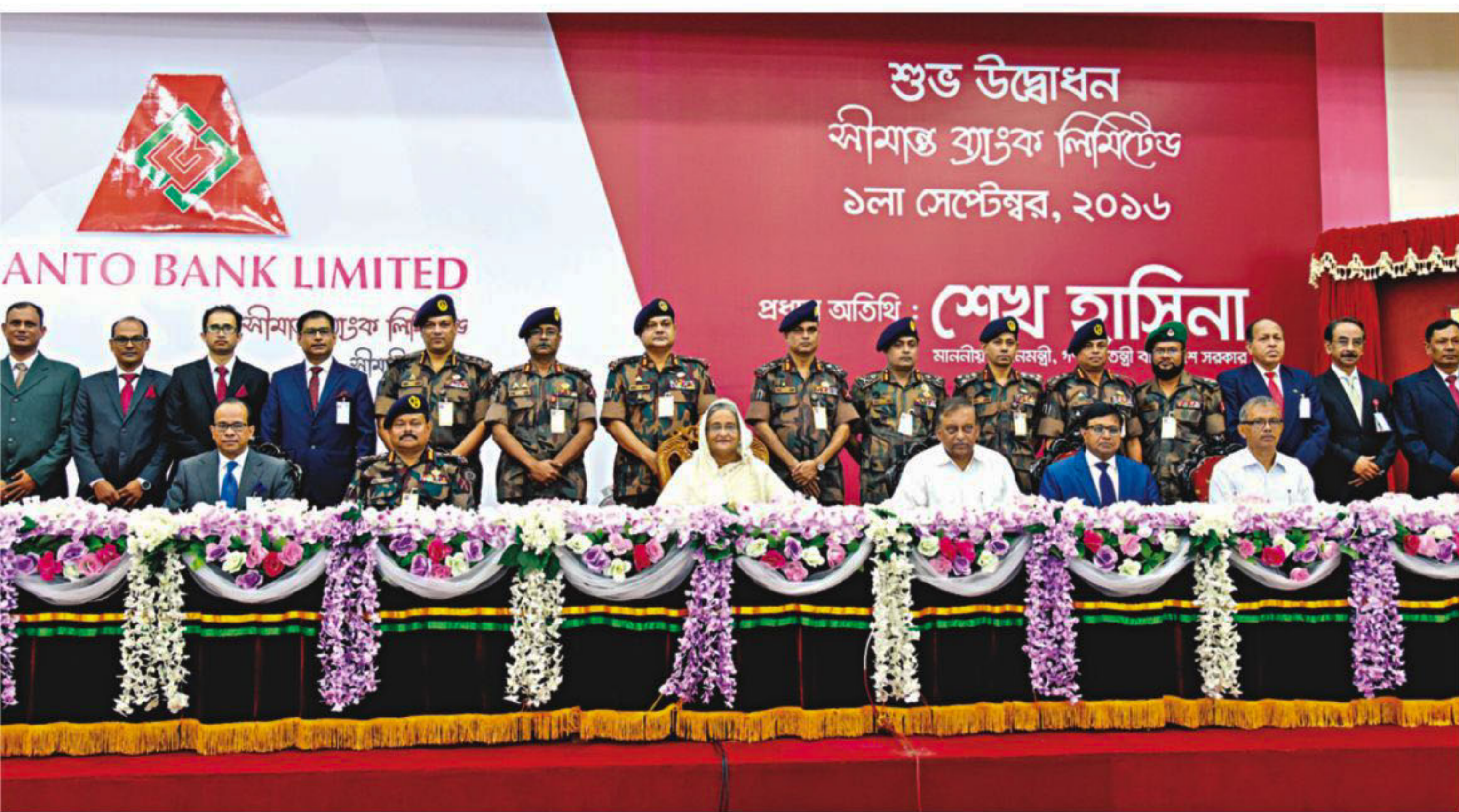
Prime Minister Sheikh Hasina with guests at the inaugural ceremony of "Shimanto Bank" in Border Guard Bangladesh headquarters in the capital yesterday. Story on page 3.

The US Embassy will be closed on Sunday on the occasion of US Labor Day, an American national holiday. The closure includes the Consular Section and the American Center with the Archer K Blood American Center Library and the EducationUSA Student Advising Center, said a press release. Emergency services for American citizens will be available. Please call 5566-2000 and ask for the duty officer.