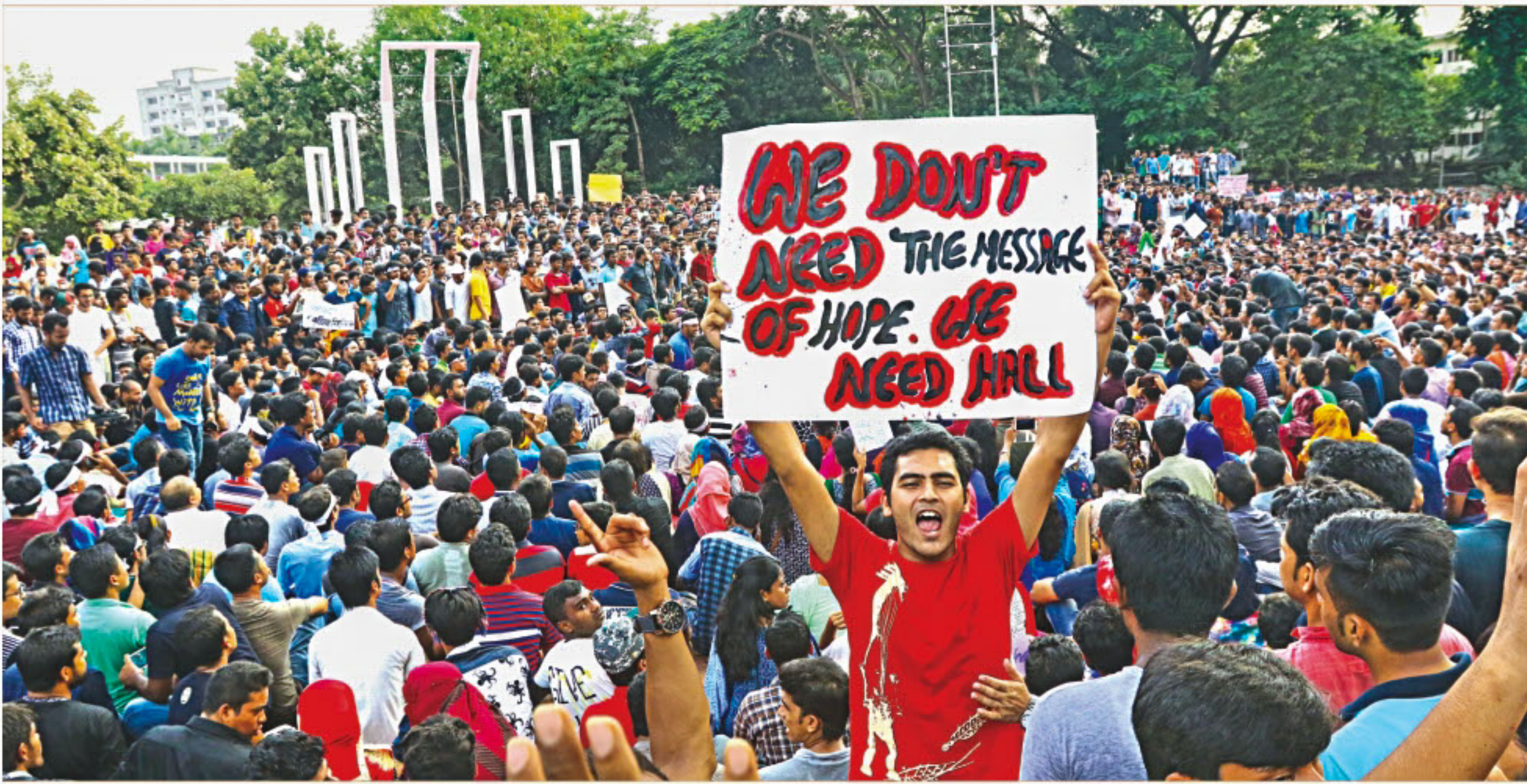
Jagannath University students demonstrate on the Central Shaheed Minar premises to press home their demand for residential halls. The photo was taken on August 26.

Administrations came and went, but the institution with some 20,000 students remains the only public university with no halls; students demand PM's intervention