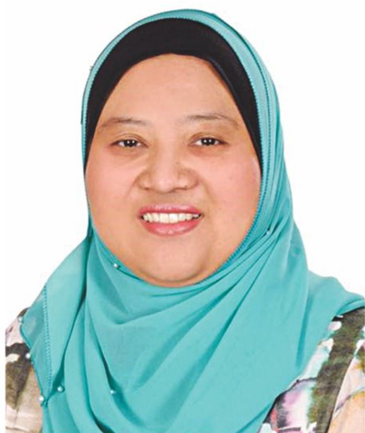
H.E. Nur Ashikin Mohd. Taib High Commissioner of Malaysia to Bangladesh

put in place a target of sustained growth rate of 5% per annum until 2020. Since 2010, the Government has implemented its transformational agenda to give impetus to Malaysia's developmental growth. Various policies were put in place, from "1 Malaysia: People First Performance Now" where steps were taken to improve public service delivery, to the Government and Economic Transformation programmes, in order to provide a fillip to the Malaysian economy following the Global Financial Crisis in 2008-2009.