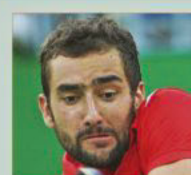
MARIN CILIC SEED: 7

Rafael Nadal has not had an easy 2016. He was forced to withdraw from the French Open after reaching the quarterfinals owing to a wrist injury. That same injury would then force the Spaniard out of Wimbledon. He has been far from his best for a long while and at the Rio Olympics he finished fourth after losing the bronze medal match to Kei Nishikori.