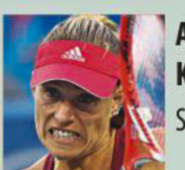
ANGELIQUE KERBER SEED: 2

With the home crowd behind her, Serena will be looking to put the misery of the Olympics behind her. Serena faced a shock exit from the Rio Olympics in the third round. And with only a Wimbledon win this season, Serena's struggles have been evident. However, she will hope to add another trophy at home and surpass Steffi Graf's Open Era record of 22 Grand Slam singles titles.