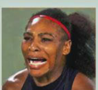
SERENA WILLIAMS SEED: 1

Since his stunning victory over Roger Federer in the 2009 US Open final, del Potro has been sidelined by injuries to both wrists. The Argentine rejoined the tour full time this year and has improved his conditioning, culminating at the Olympics, where he beat Djokovic in the first round and Nadal in the semifinals before narrowly losing gold. He will be hoping to go one better at Flushing Meadows.