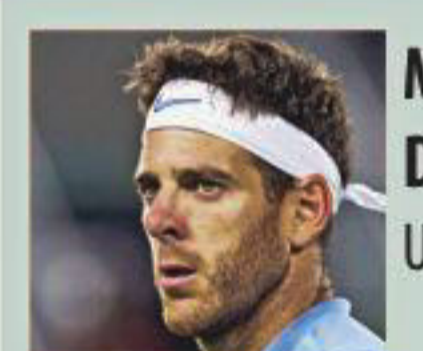
MARTIN DEL POTRO UNSEED

The 27-year-old won his first Masters 1000 tournament in Cincinnati in August and re-entered the top 10 with a straight-sets victory over Murray. Cilic is seeded seventh and his rising level of play suggests that he could be rounding into the kind of form that led him to the title in 2014. Cilic worked on his forehand and return with a new coach. And against Murray he returned well but his forehand remains suspect.