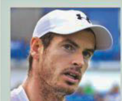
ANDY MURRAY SEED: 2

It took Andy Murray 4 hours in the Olympic final, but in the end he became the first person to retain the singles gold medal. Preceding that was another hard-fought win in Wimbledon. However, Murray's disproportionate hours on the court will definitely take a toll on the Brit, who looked hassled as he lost in the Cincinnati Masters tournament to Marin Cilic in August.