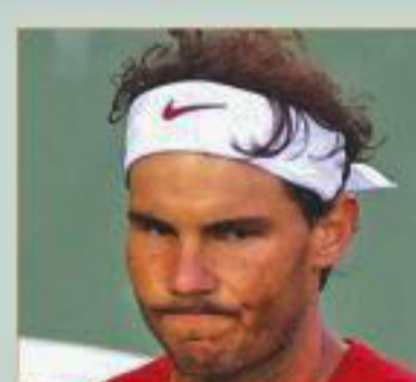
RAFAEL NADAL SEED: 4

With a win at the French Open seeing the Serb hold all four grand slam titles at the same time, 2016 seemed the perfect setting for Djokovic. He followed that up with a win at Roland Garros, but since then has had a torrid time, admitting he is not 100 fully fit. He lost in the third round at Wimbledon and made a first round exit at Rio, so he will be hoping to return to form here.