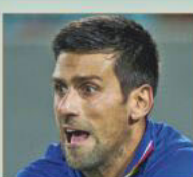
NOVAK DJOKOVIC SEED: 1

It took Andy Murray 4 hours in the Olympic final, but in the end he became the first person to retain the singles gold medal. Preceding that was another hard-fought win in Wimbledon. However, Murray's disproportionate hours on the court will definitely take a toll on the Brit, who looked hassled as he lost in the Cincinnati Masters tournament to Marin Cilic in August.