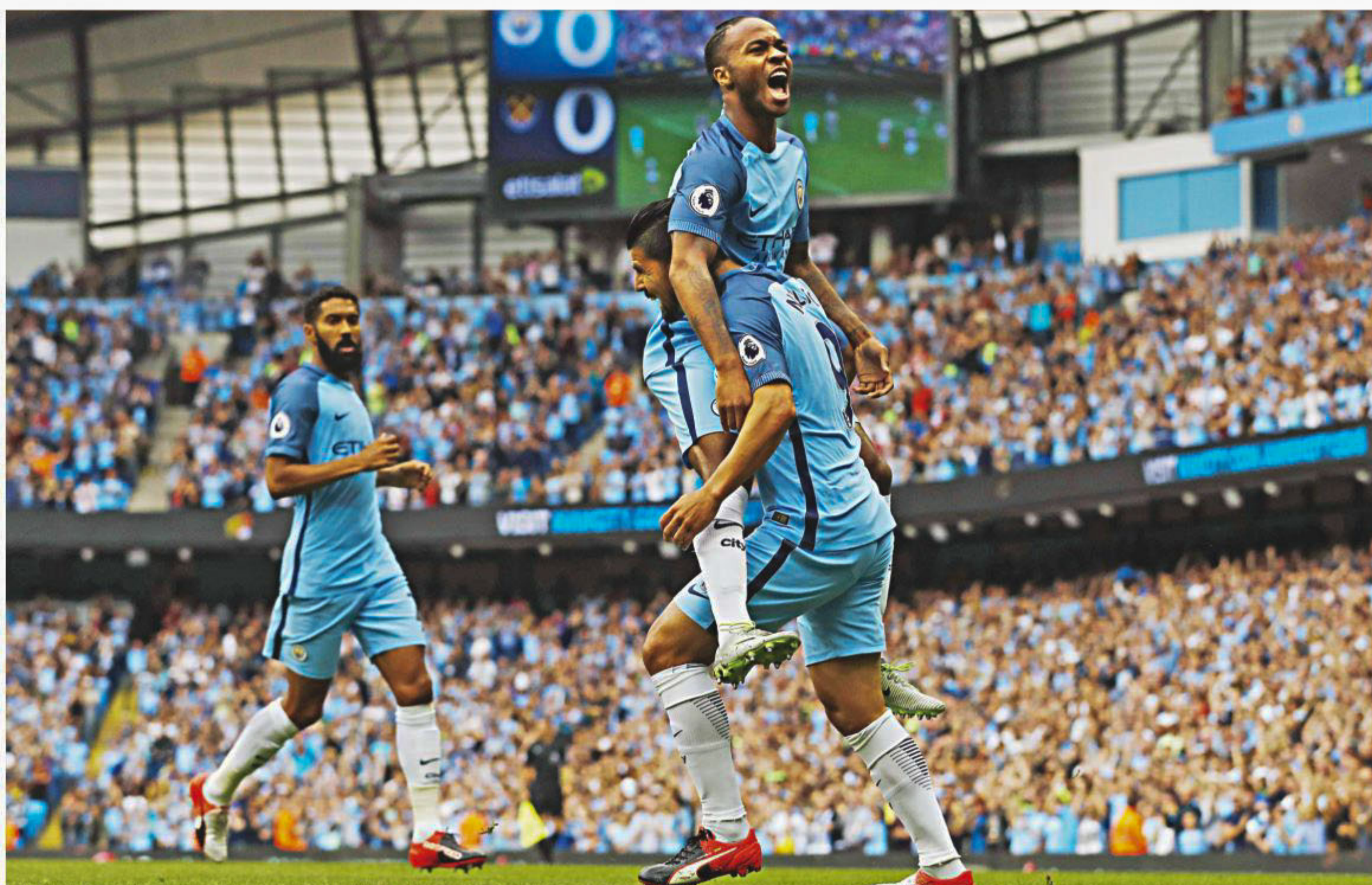
Raheem Sterling may have become the poster boy for England's woeful Euro 2016 campaign but there was no denying the Manchester City forward's class in the English Premier League as he scored twice against the Hammers at Eastlands in his side's 3-1 win on Sunday. The victory took City at the top of the table on goal difference from Chelsea and Manchester United, who've also made a perfect played three, won three start to the season.

One setback for United was a back injury to midfielder Marouane Fellaini, which makes him a doubt for Belgium's World Cup qualifier in Cyprus in September 6.