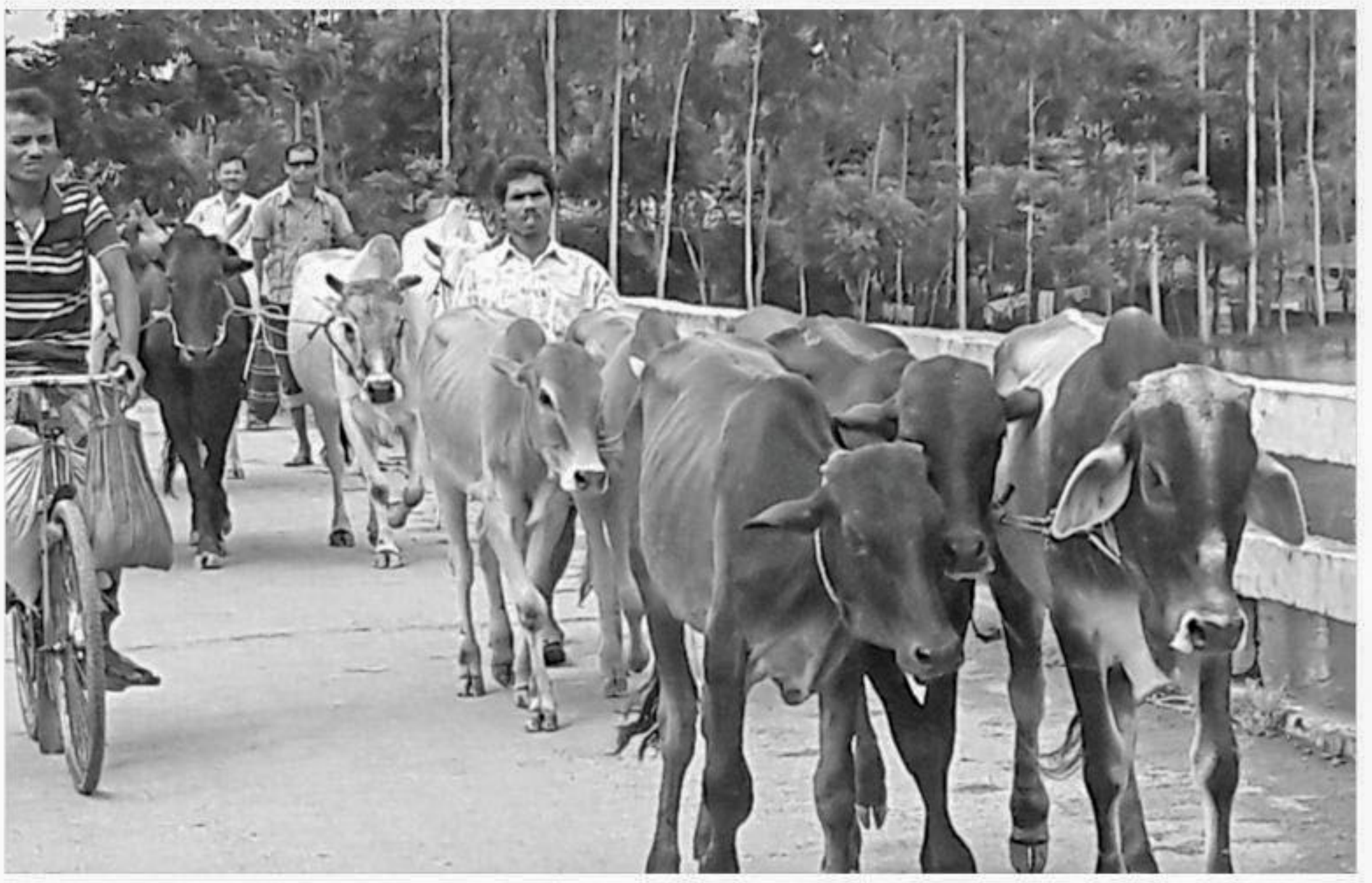
Cattle brought from India are being taken to a market in Mogolhat border area of Lalmonirhat Sadar upazila a few days ago.