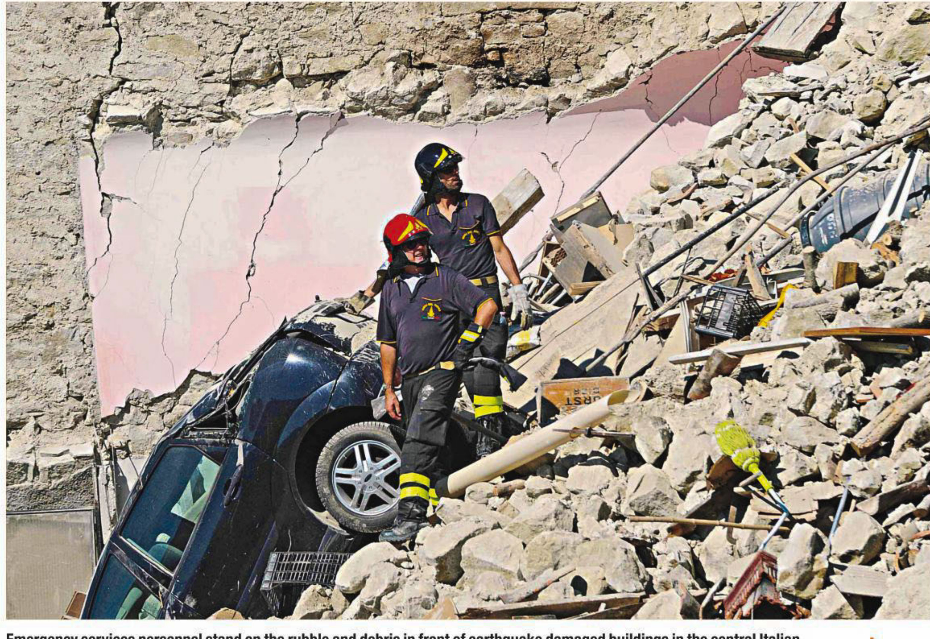
Emergency services personnel stand on the rubble and debris in front of earthquake damaged buildings in the central Italian village of Pescara del Tronto yesterday, a day after a 6-6.2 magnitude earthquake struck the region, killing at least 250 people.