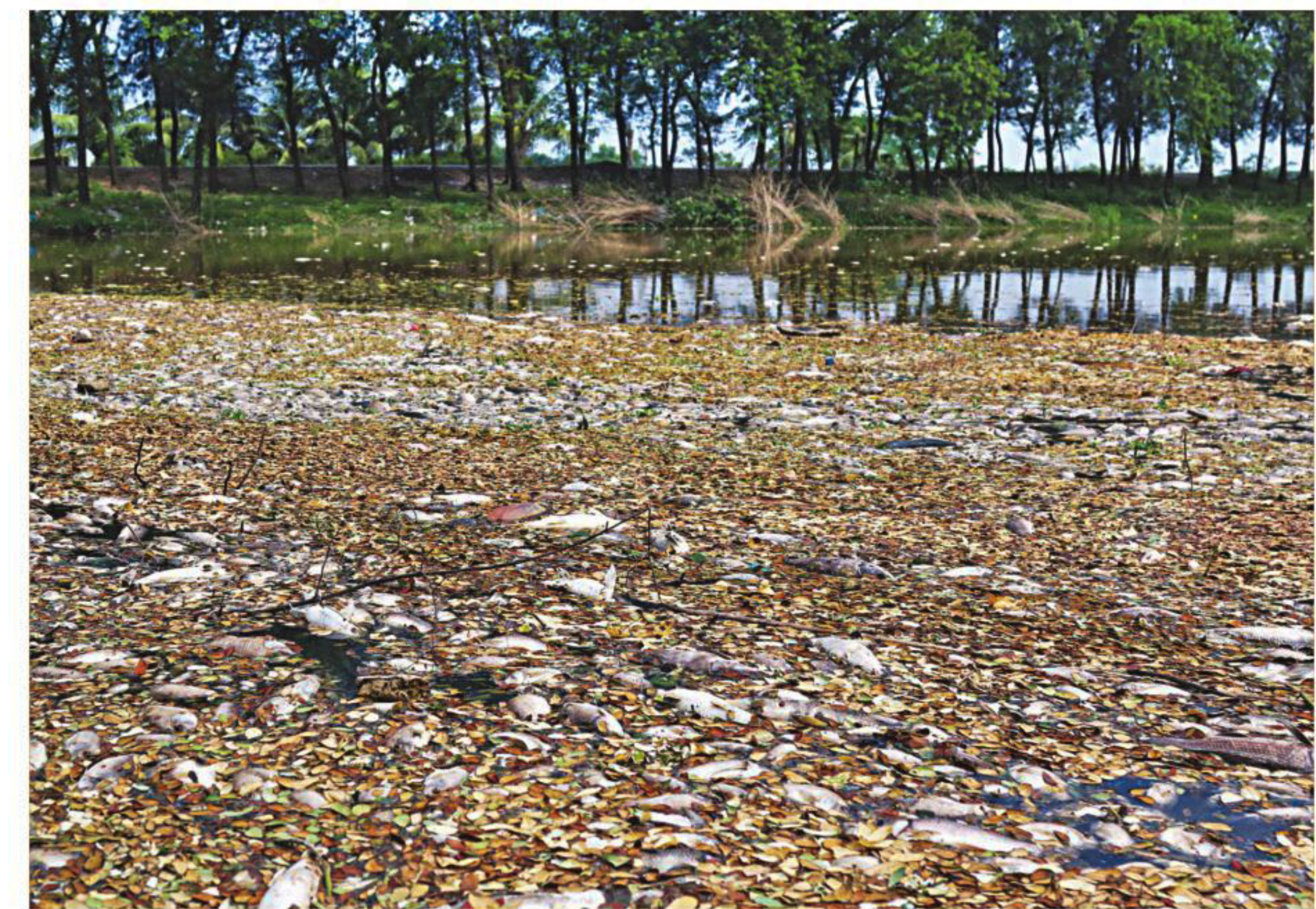
The stench of rotting fish in surrounding areas is slowly overpowering that of ammonia released following a gas tank explosion in a factory of DAP Fertiliser Company Ltd in Chittagong's Anwara upazila on Monday night. The photo was taken yesterday.