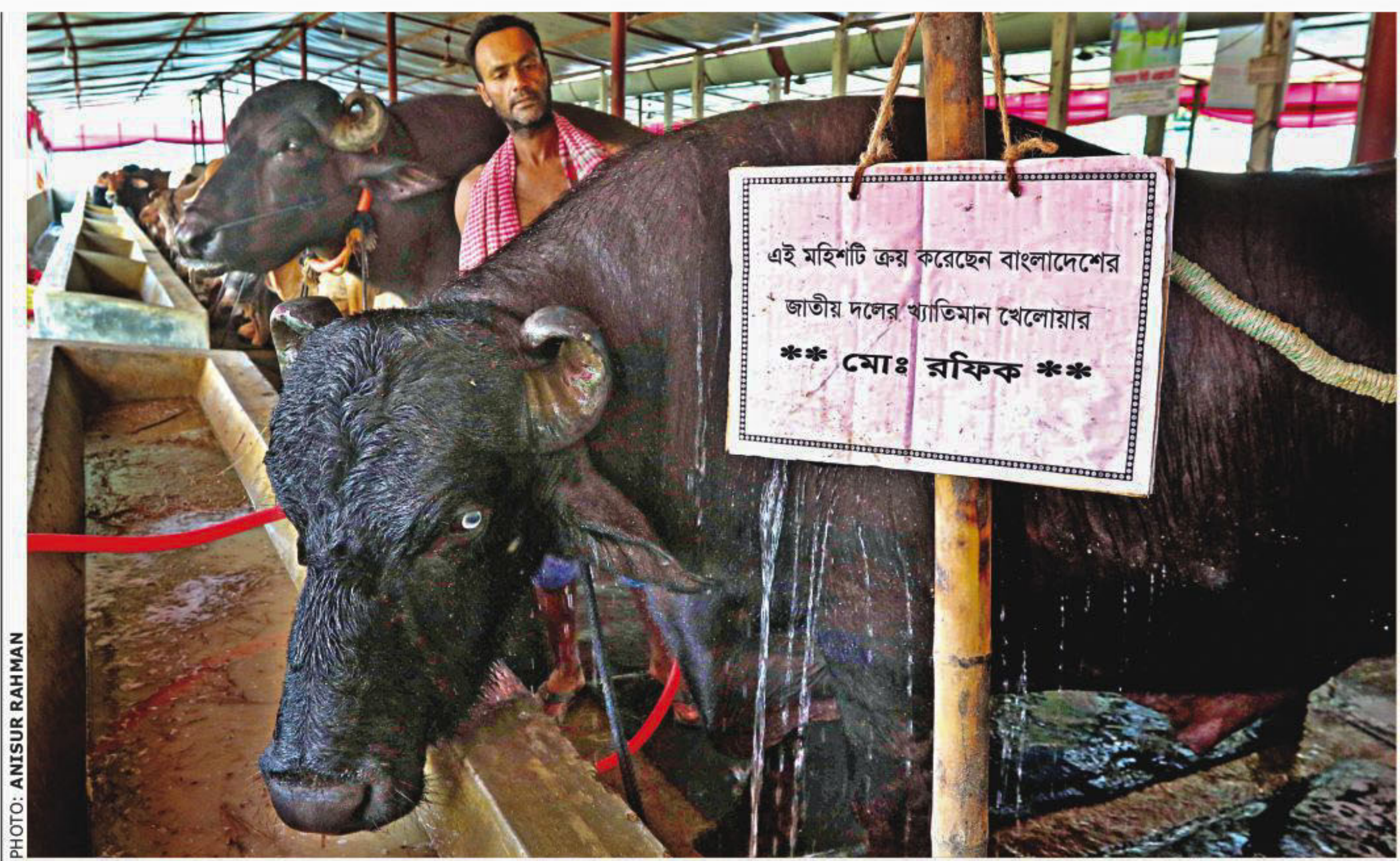
Do we need a caption for this when the signboard close to a giant water buffalo says it all? The only relevant insight is that former Bangladesh left-arm spinner Mohammad Rafique bought this sacrificial animal well ahead of the second biggest Muslim festival Eid-ul-Azha. This picture was taken at the Anwar City Agro vet farm in Keraniganj yesterday and the caretaker of the farm said that they put a price tag of Tk four lakh on the animal. Contacted over phone the cricketer said with his usual Dhakaite accent: "From the day I've started performing Qurbani (sacrificial offer) I have always sacrificed a buffalo along with other sacrificial animals."