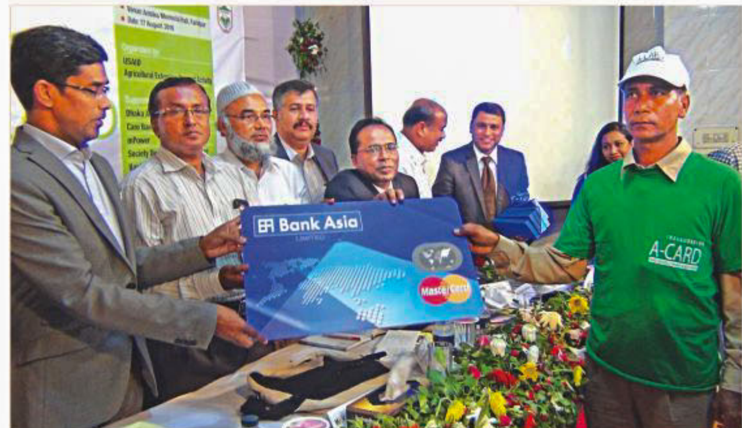
A farmer receiving his A-card at a programme in Faridpur recently.

Under a multi-actor initiative, led by the USAID Agricultural Extension Support Activity, the farmers would get, in phases, the A-card SEE PAGE 2 COL 1