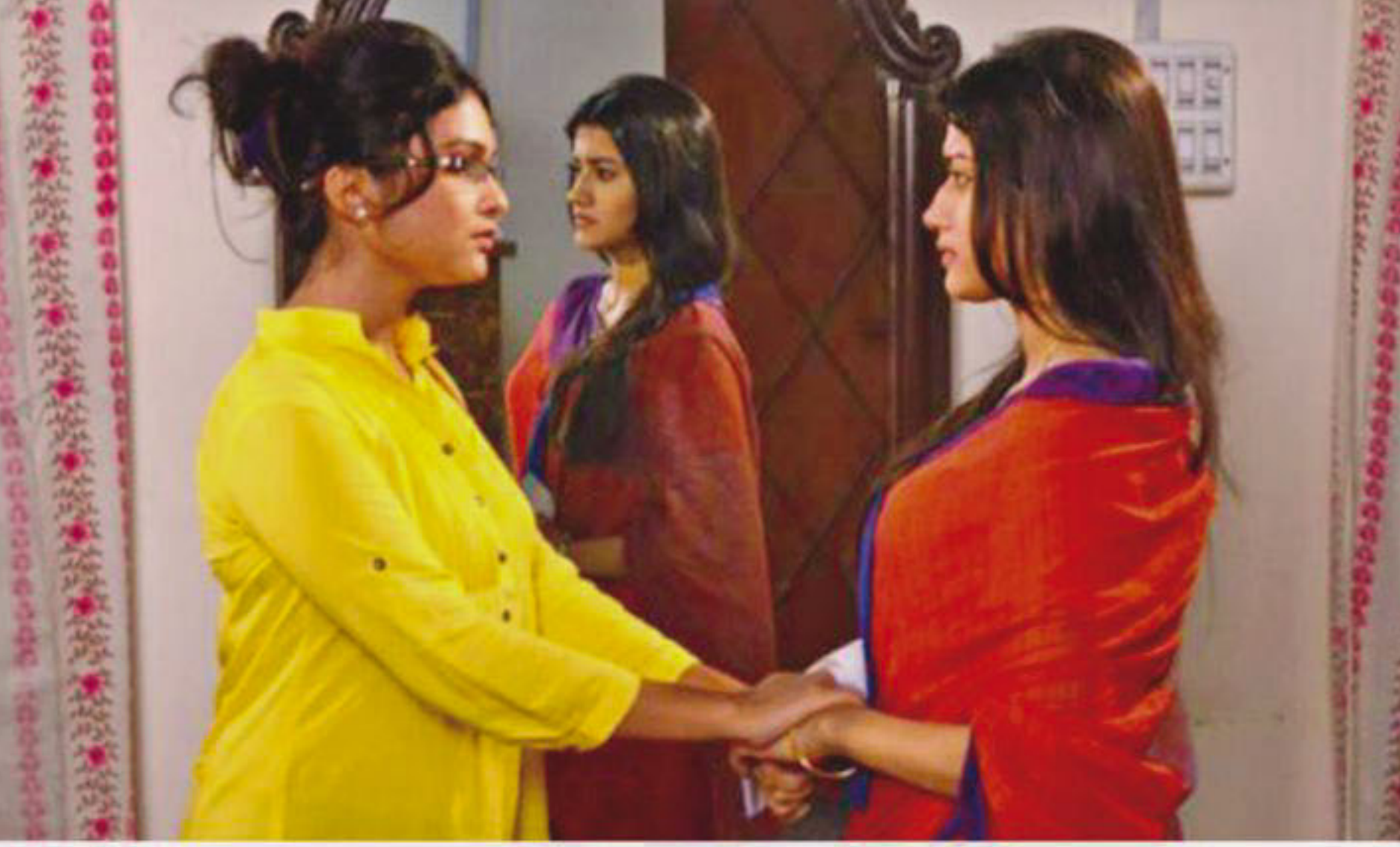
A scene from "Dressing Table".

"Dressing Table" was cleared by Bangladesh censor board on August 22, Sayeed told The Daily Star adding he hopes to commercially release the film in Bangladesh September-end. The film has also been sent for the International Film Festival of India to be held in Goa in November.