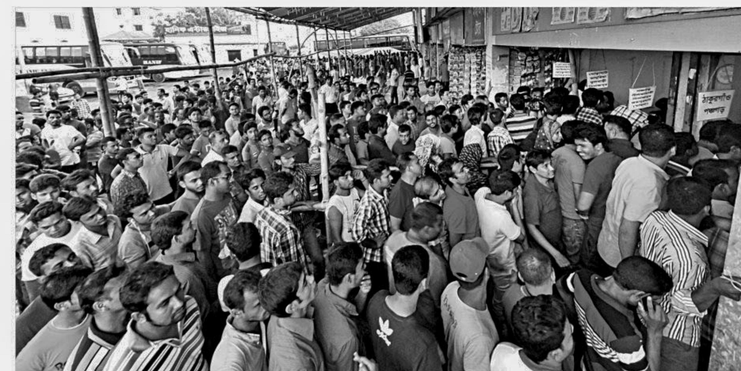
Dhaka's Gabtoli bus terminal sees a huge rush of ticket seekers on the first day of advance sale yesterday, ahead of Eid-ul-Azha.