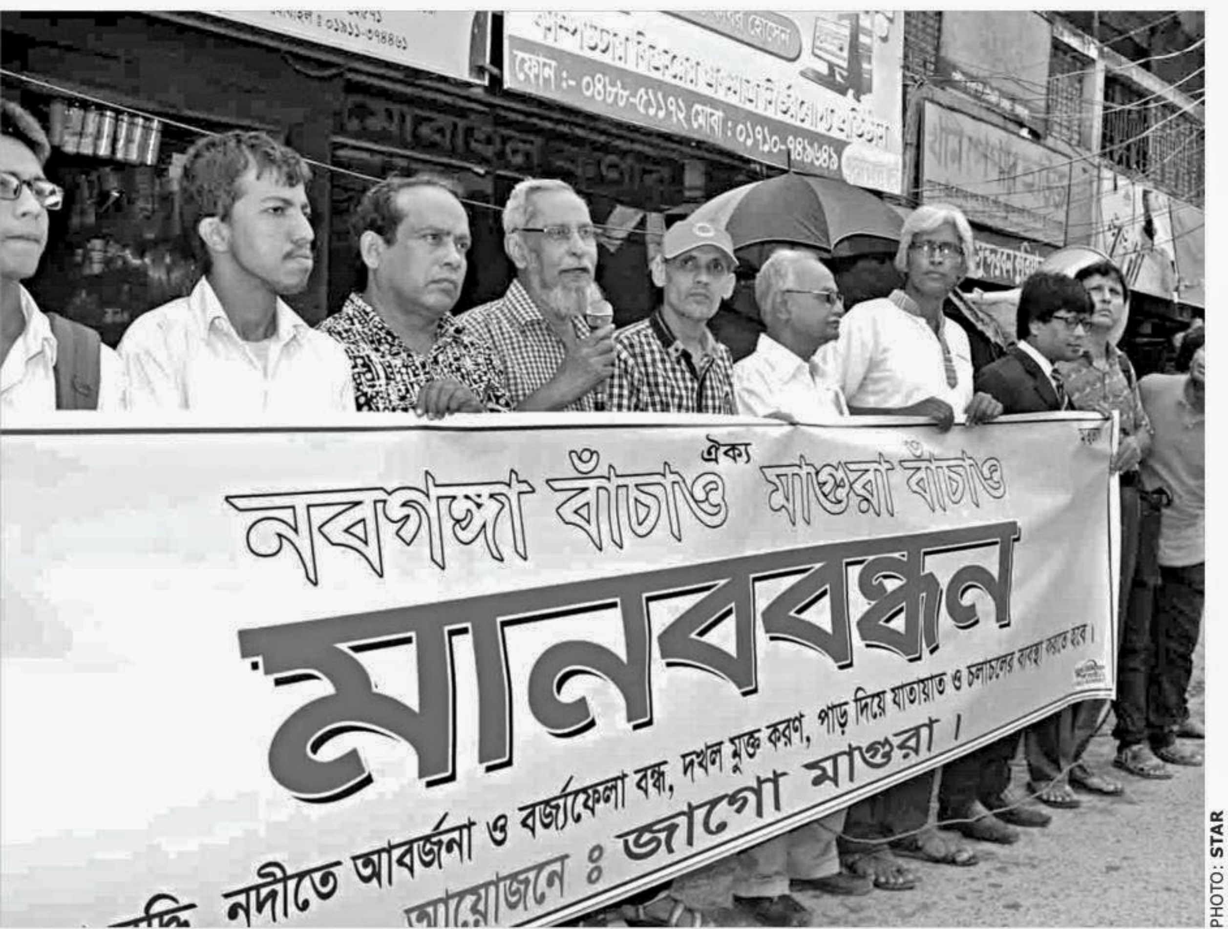
Local people under the banner of Jago Magura form the human chain with the slogan 'Save Nabaganga, save Magura' at Chourangi intersection in Magura town yesterday, demanding steps to stop polluting the River Nabaganga.