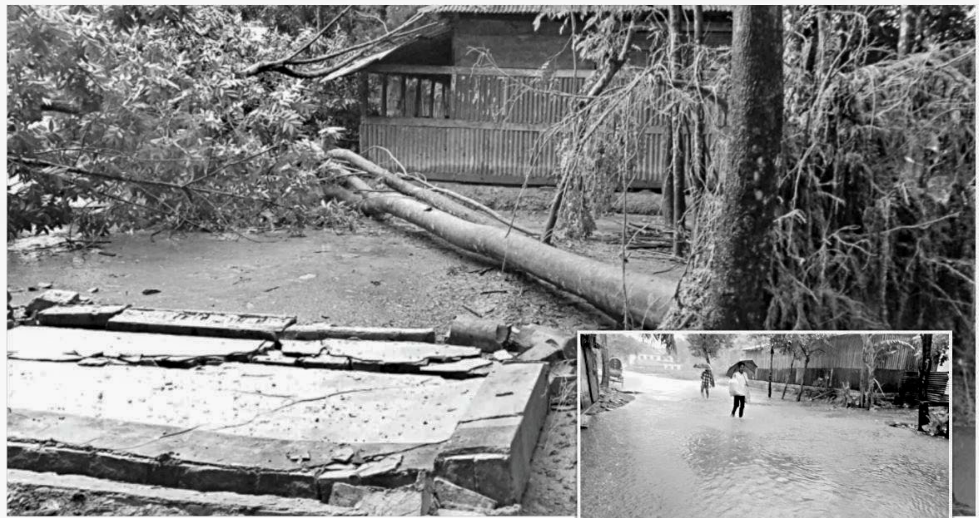
Trees lie uprooted at Keundia village in Kawkhali upazila under Pirojpur district due to heavy rain accompanied by gusty wind affecting coastal districts during the last two days. Inset, a road flooded by rainwater in Patuakhali town.

Basudev Chandra Roy, an official of DAE, said the rain came as a blessing for the farmers who were struggling to irrigate their land amid lack of rain for the last two months.