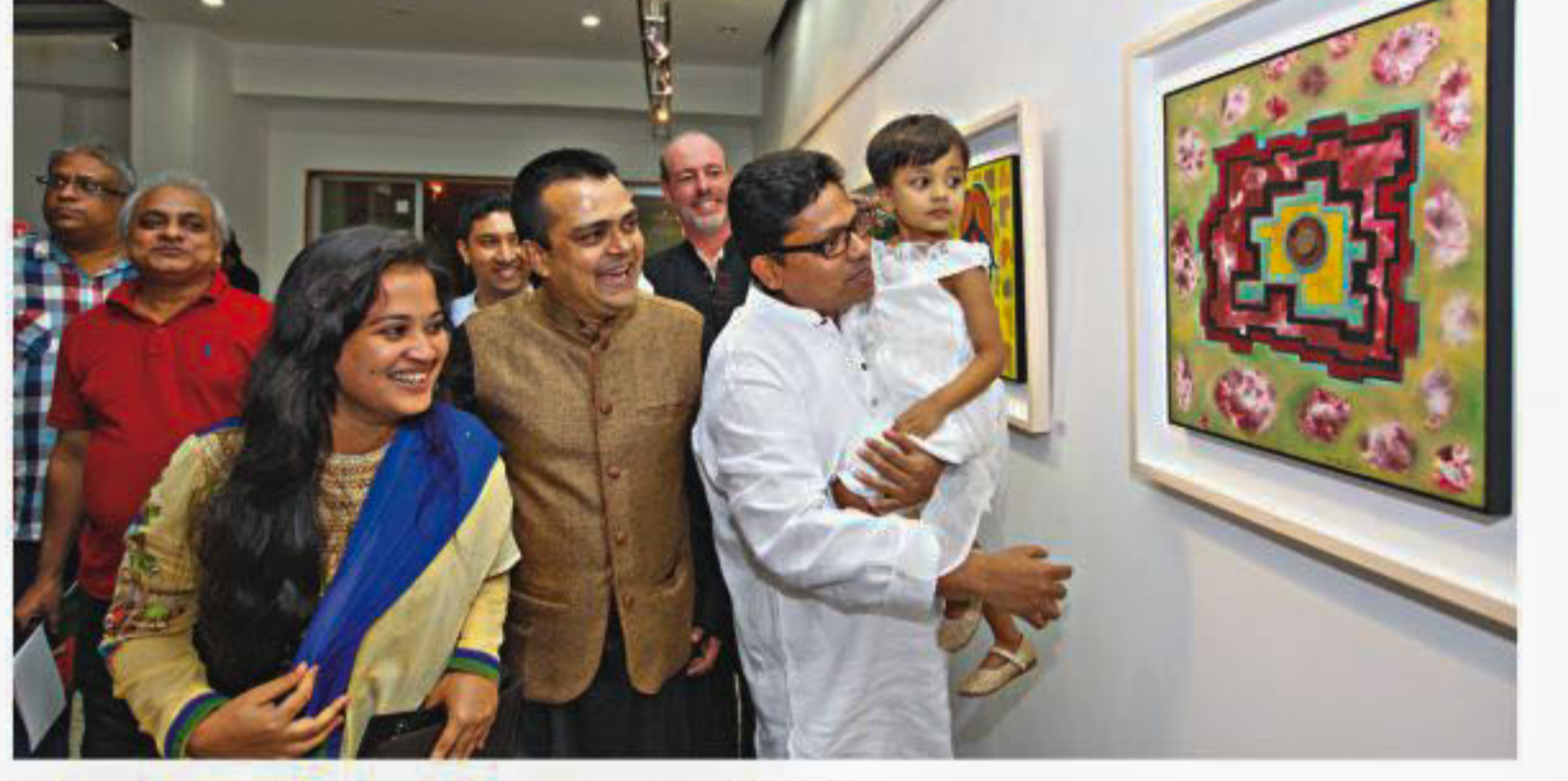
Visitors with the artist (C) at the exhibition.