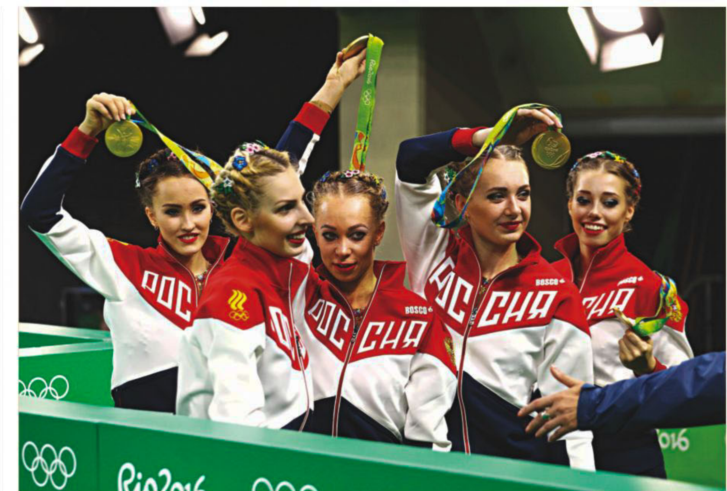
The victorious five-woman Russian team pose with their gold medals after winning the rhythmic gymnastics group all-around event at the Rio Olympics on the final day of competition on Sunday. This was the fifth straight gold medal in the event for Russia as they have emerged victorious in all editions starting with the 2000 Sydney Olympics. With Margarita Mamun winning the individual event earlier, the group win marked the fifth time that Russia won both titles. Spain finished with silver and Bulgaria bronze.