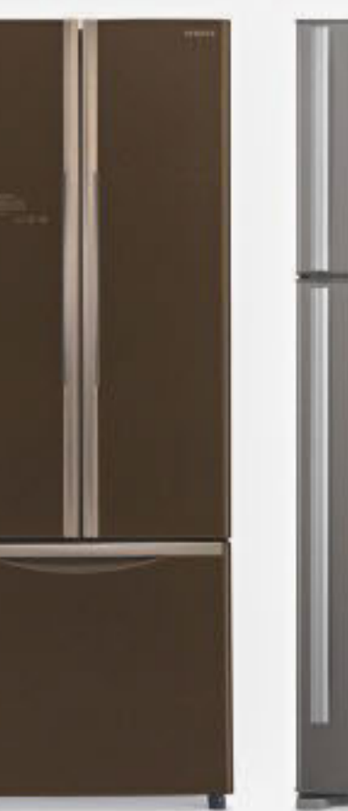
French Bottom Freezer