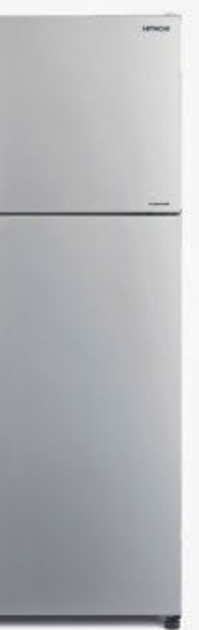
New Stylish Line

Before you buy any Hitachi Refrigerators, be sure they are imported by Hitachi authorised distributors in Bangladesh Transcom Digital and Best Electronics .