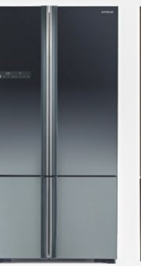
French Bottom Freezer