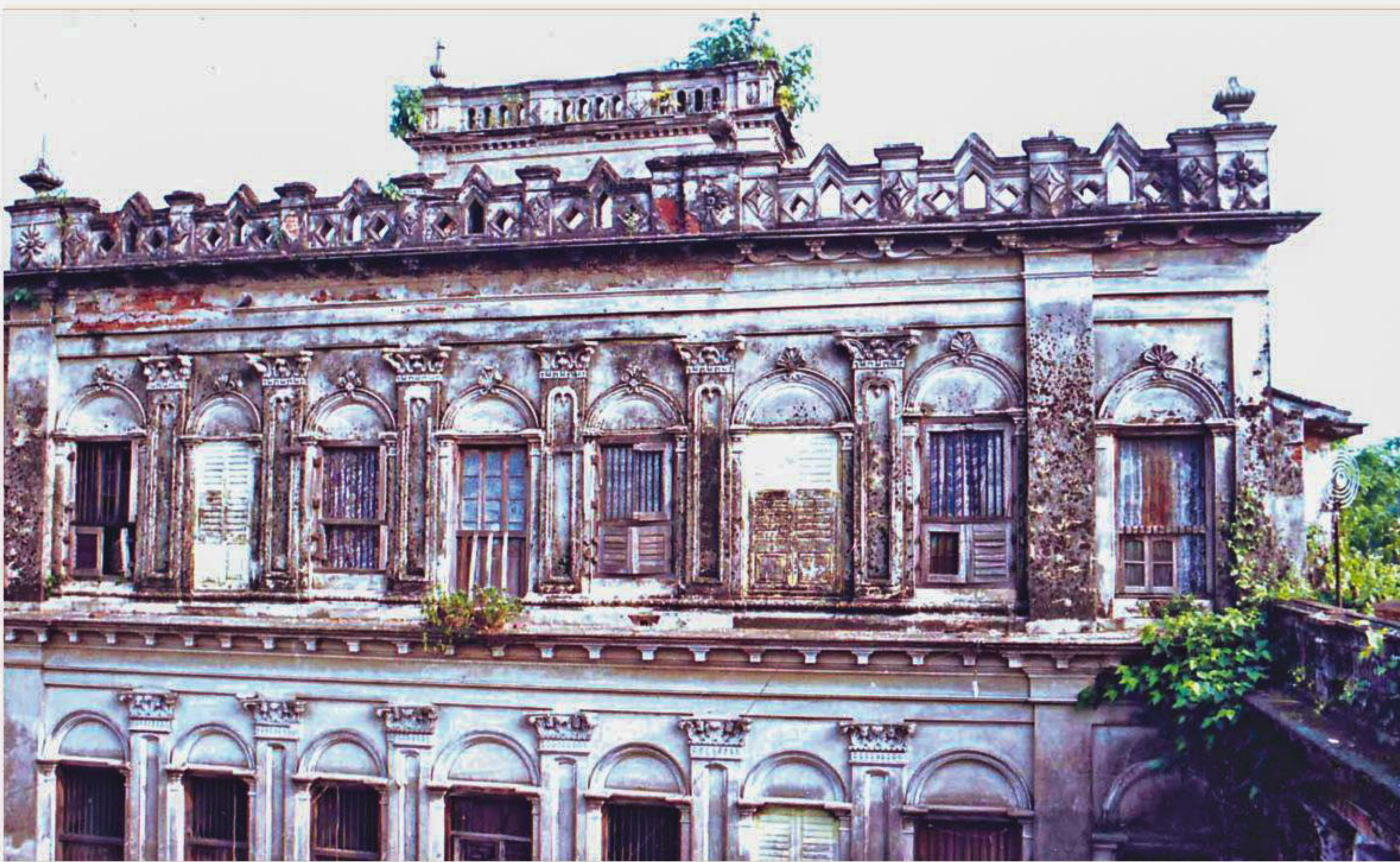
The Balapur Zamindar Bari in Narsingdi. The decorative structure is now on the verge of collapse for lack of maintenance and repair. The photo was taken recently.