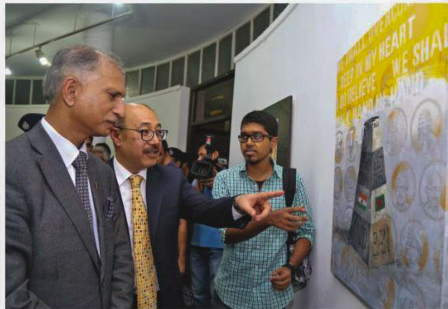
The guests at the exhibition.

A prize distribution ceremony was held on 16 August at Zainul Gallery, FFA where the paintings of contestants were exhibited for the next four days. The ceremony was followed by the inauguration of the exhibition by Harsh Vardhan Shringla, High Commissioner of India to Bangladesh.